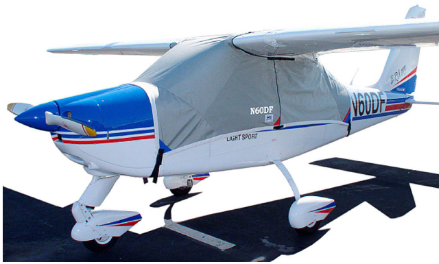
Tecnam Bravo Canopy Cover