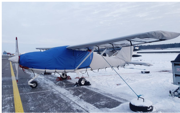
Tecnam P2010 Wing, Empennage & Prop Covers