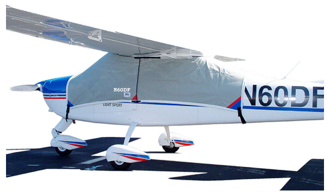
Tecnam Bravo Canopy Cover