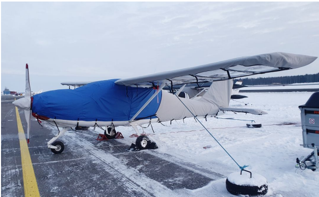
Tecnam P2010 Wing, Empennage & Prop Covers

WINTER USE MATERIAL - Made with Solution-Dyed Polyester fabric, this option is intended for seasonal use to aid in deicing, rain mitigation, or for occasional travel. The material is lighter and more compact, but more susceptible to UV damage and may have a shorter useful life if used continuously outside than the all-year use material.