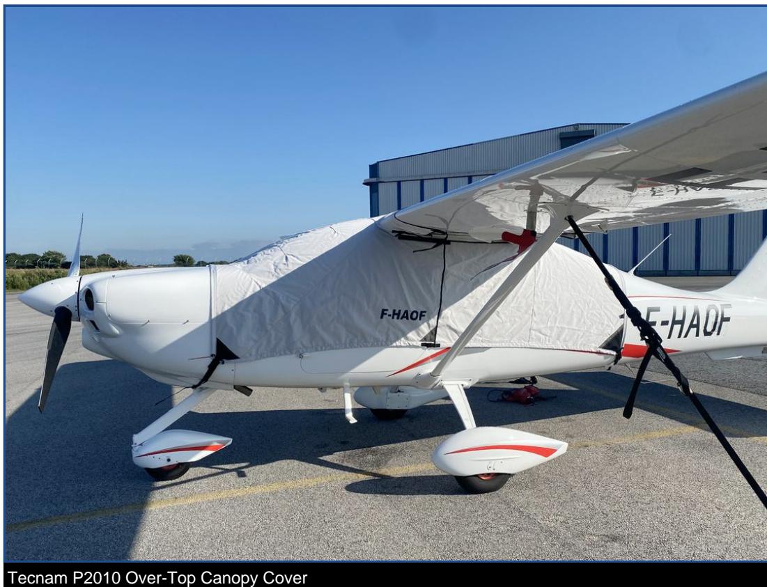
Tecnam P2010 Over-Top Canopy Cover