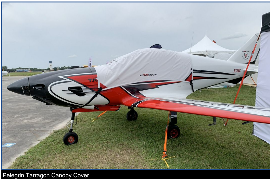
Pelegrin Tarragon Canopy Cover