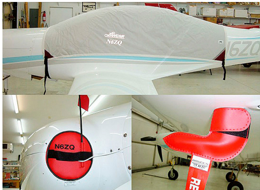
Recommended fly-away kit: Canopy Cover, Engine Inlet Plugs & Pitot Cover

This cover type is made from Silver Acrylic Sunbrella canvas and is 100% lined with a soft and smooth microfiber. Bruce's Custom Covers developed this material combination especially for aircraft protection. The outer material is medium weight and treated for water resistance, UV resistance and anti-static buildup. The inner lining is a very soft and smooth microfiber to prevent scratching. The material is very reflective, and tests show that the cabin interior temperature can be reduced to near-ambient temperature on the hottest of days. It is water, ice and snow repellent, yet breathable to allow moisture to escape from between the cover and the aircraft surface.