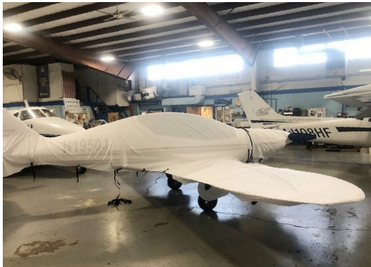
Shark 600 Complete Cover Set, test fit

WINTER USE MATERIAL - Made with Solution-Dyed Polyester fabric, this option is intended for seasonal use to aid in deicing, rain mitigation, or for occasional travel. The material is lighter and more compact, but more susceptible to UV damage and may have a shorter useful life if used continuously outside than the all-year use material.