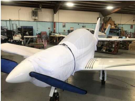
Shark 600 Complete Cover Set, test fit