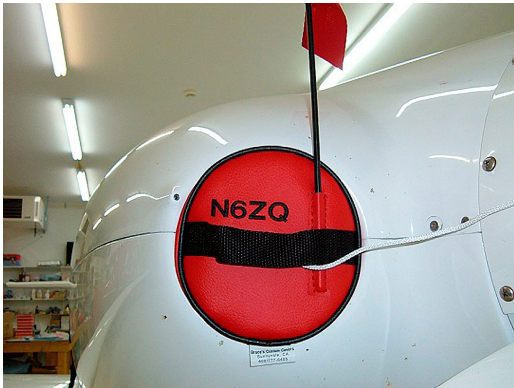
Lancair 320 Engine Inlet Plugs

Engine Inlet Plugs are custom fit for your Shark UL, sportShark, Shark 600 intakes, made with heavy-duty vinyl material, and stuffed with a single block of sculpted urethane foam. Each plug has a zipper that allows the foam to be removed and dried if necessary. Engine plugs have warning flags that are visible from the cockpit or 'remove before flight' streamers sewn onto the face of the plugs. Most plugs are imprinted with the aircraft registration number in black for an extra charge. Storage bag NOT included. Engine plugs may be inserted after flight when the engine is still warm. Engine Inlet Plugs are commonly referred to as Cowl Plugs, Intake Plugs, Cowl Blocks, Engine Blocks, and Engine Bungs.