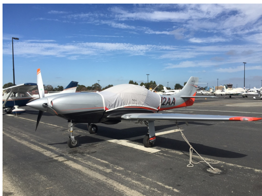
Lancair Legacy 2000 Travel Canopy Cover

Travel Covers are made with Silver Solution-Dyed Polyester fabric and only lined over the windshield to save weight. The material is lightweight and more compact for easy stowage in the aircraft. The polyester material is water resistant, but only intended for occasional use outside. We also have an ultra lightweight material available for fitted hangar dust covers. For daily outdoor use, the non-travel Sunbrella Cover is the best choice.