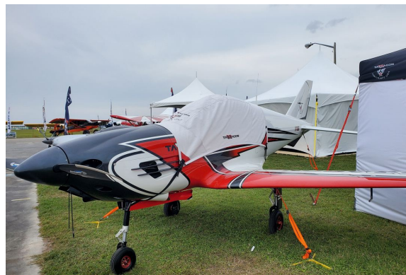
Pelegrin Tarragon Canopy Cover