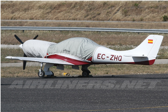
Lancair 360 Canopy Cover, Engine Cover