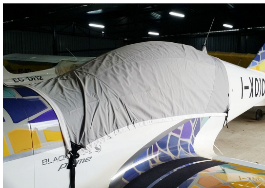
Blackshape Prime Travel Cover, Light Weight Travel Canopy Cover