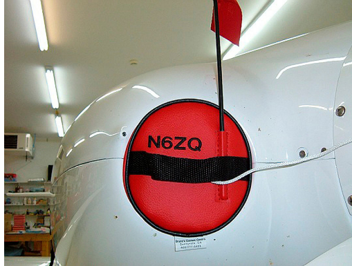
Lancair 320 Engine Inlet Plugs

Engine Inlet Plugs are custom fit for your Shark UL, sportShark, Shark 600 intakes, made with heavy-duty vinyl material, and stuffed with a single block of sculpted urethane foam. Each plug has a zipper that allows the foam to be removed and dried if necessary. Engine plugs have warning flags that are visible from the cockpit or 'remove before flight' streamers sewn onto the face of the plugs. Most plugs are imprinted with the aircraft registration number in black for an extra charge. Storage bag NOT included. Engine plugs may be inserted after flight when the engine is still warm. Engine Inlet Plugs are commonly referred to as Cowl Plugs, Intake Plugs, Cowl Blocks, Engine Blocks, and Engine Bungs.