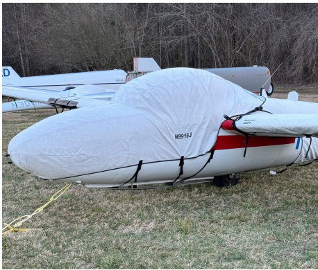
Schweizer SGS 2-32 Complete Cover Set

WINTER USE MATERIAL - Made with Solution-Dyed Polyester fabric, this option is intended for seasonal use to aid in deicing, rain mitigation, or for occasional travel. The material is lighter and more compact, but more susceptible to UV damage and may have a shorter useful life if used continuously outside than the all-year use material.