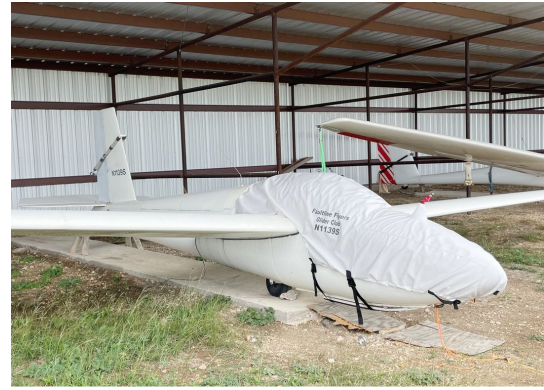
Schweizer 1-26E Canopy/Nose Cover