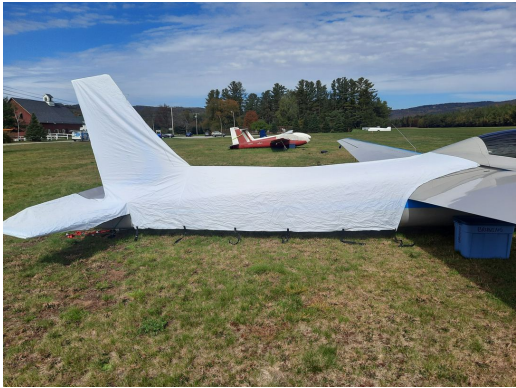
Schweizer 232 Empennage Cover, test fit cover

WINTER USE MATERIAL - Made with Solution-Dyed Polyester fabric, this option is intended for seasonal use to aid in deicing, rain mitigation, or for occasional travel. The material is lighter and more compact, but more susceptible to UV damage and may have a shorter useful life if used continuously outside than the all-year use material.