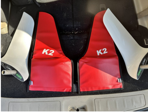
Discus CS Wingtip Pads (Set of 2)

Designed to prevent damage to the aircraft extremities in crowded hangars, these products are made of bright red Naugahyde and thickly padded with a sandwich of closed cell foam. Nowadays they are also made using bright red Neoprene padded laminated (think: wetsuit material).