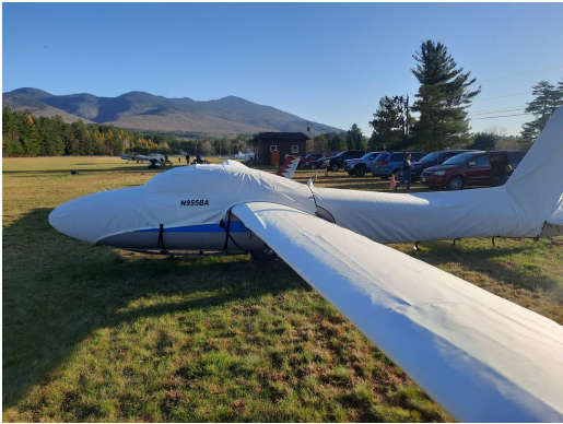
Schweizer 2-32 Full Cover Set