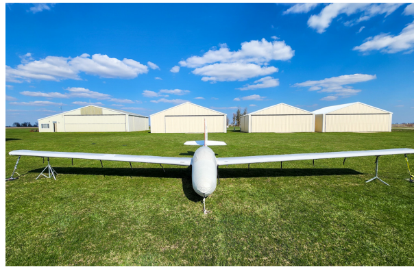
Schweizer SGS, SGU, 1 & 2 Models Wing Covers, 1-26 Models, All Year Use (12.2m Wingspan)