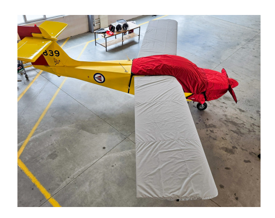
Saab Safari MFI-15, MFI-17 Canopy, Insulated Prop & Engine, Wing Covers

Travel Covers are made with Silver Solution-Dyed Polyester fabric and only lined over the windshield to save weight. The material is lightweight and more compact for easy stowage in the aircraft. The polyester material is water resistant, but only intended for occasional use outside. We also have an ultra lightweight material available for fitted hangar dust covers. For daily outdoor use, the non-travel Sunbrella Cover is the best choice.