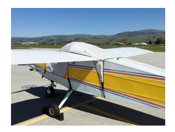
Bolkow Junior 208 Canopy Cover