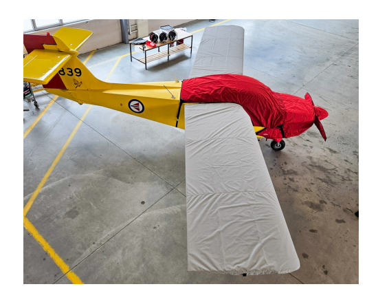
Saab Safari MFI-15, MFI-17 Canopy, Insulated Prop & Engine, Wing Covers