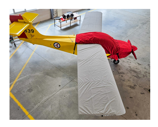
Saab Safari MFI-15, MFI-17 Canopy, Insulated Prop & Engine, Wing Covers