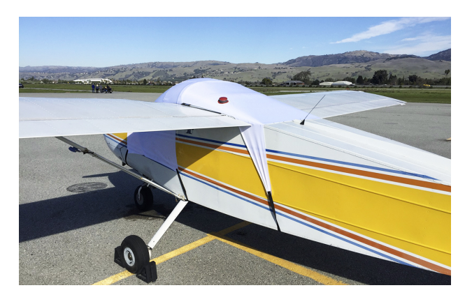
Bolkow Junior 208 Canopy Cover (test fit)