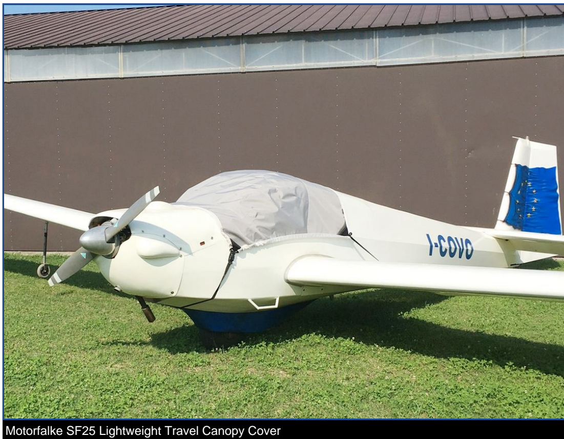
Motorfalke SF25 Lightweight Travel Canopy Cover