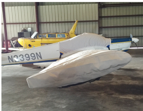
Scheibe Falke SF25 Canopy & Wing Covers