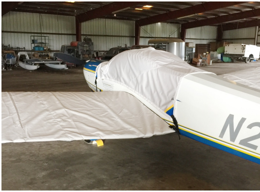
Scheibe Falke SF25 Canopy & Wing Covers