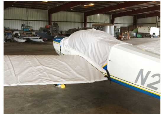
Scheibe Falke SF25 Canopy & Wing Covers