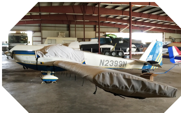
Scheibe Falke SF25 Canopy & Wing Covers