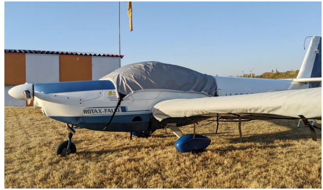
Falke SF-25 C Light Weight Travel Canopy Cover