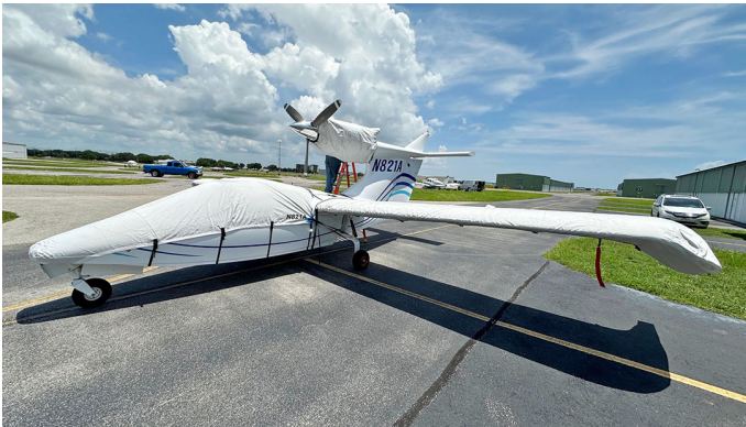
Seawind Seawind 300C & 3000 Amphibian Wing Covers, All Year Use