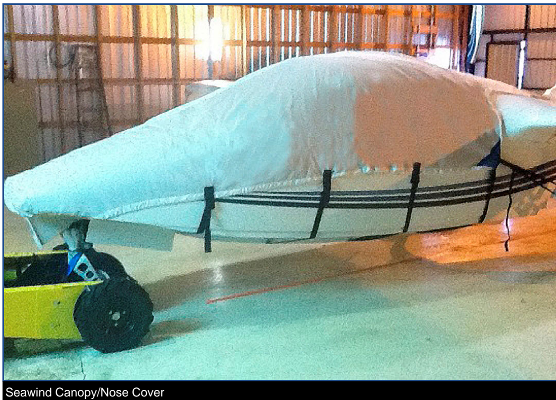
Seawind Canopy/Nose Cover