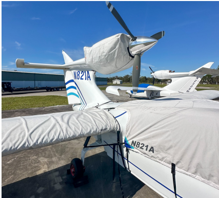
Seawind Seawind 300C & 3000 Amphibian Wing Covers, All Year Use