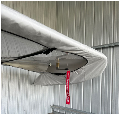
Seawind 300C & 3000 Wing Covers

WINTER USE MATERIAL - Made with Solution-Dyed Polyester fabric, this option is intended for seasonal use to aid in deicing, rain mitigation, or for occasional travel. The material is lighter and more compact, but more susceptible to UV damage and may have a shorter useful life if used continuously outside than the all-year use material.