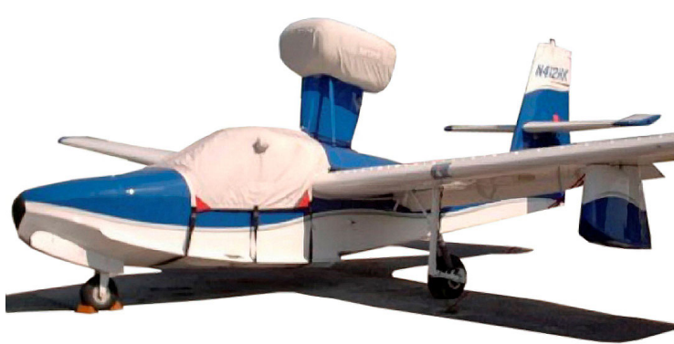
Lake Canopy & Engine Covers

This cover type is made from Silver Acrylic Sunbrella canvas and is 100% lined with a soft and smooth microfiber. Bruce's Custom Covers developed this material combination especially for aircraft protection. The outer material is medium weight and treated for water resistance, UV resistance and anti-static buildup. The inner lining is a very soft and smooth microfiber to prevent scratching. The material is very reflective, and tests show that the cabin interior temperature can be reduced to near-ambient temperature on the hottest of days. It is water, ice and snow repellent, yet breathable to allow moisture to escape from between the cover and the aircraft surface.