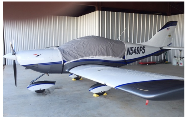
PiperSport Light Weight Travel Cover