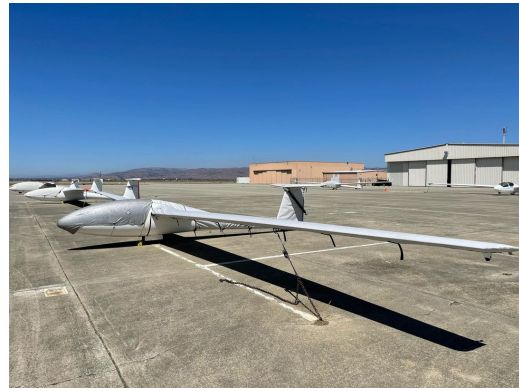
Schempp-Hirth Standard Cirrus Wing & Empennage Covers