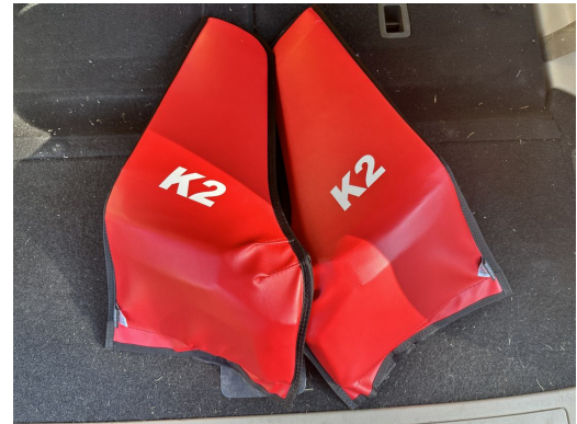
Discus CS Wingtip Pads (Set of 2)