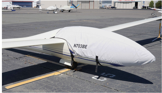
Schempp-Hirth Ventus C Canopy/Nose Cover