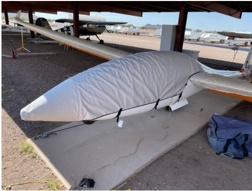
Schempp-Hirth Duo Discus Canopy/Nose Cover

The material is very reflective, and tests show that the cabin interior temperature can be reduced to near-ambient temperature on the hottest of days. It is water, ice and snow repellent, yet breathable to allow moisture to escape from between the cover and the aircraft surface.