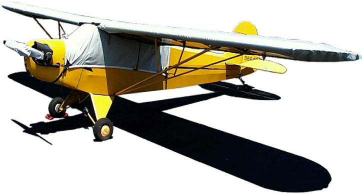
Piper J3 Canopy, Wing and Prop Covers