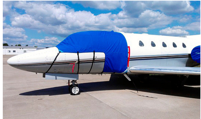
Rockwell Sabre Cockpit/Door Cover