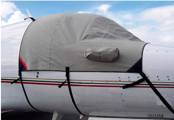
Sabre Cockpit Cover

This cover type is made from Silver Acrylic Sunbrella canvas and is 100% lined with a soft and smooth microfiber. Bruce's Custom Covers developed this material combination especially for aircraft protection. The outer material is medium weight and treated for water resistance, UV resistance and anti-static buildup. The inner lining is a very soft and smooth microfiber to prevent scratching. The material is very reflective, and tests show that the cabin interior temperature can be reduced to near-ambient temperature on the hottest of days. It is water, ice and snow repellent, yet breathable to allow moisture to escape from between the cover and the aircraft surface.