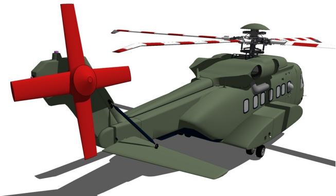
Sikorsky S-92 Tail Rotor Blade and Hub Covers