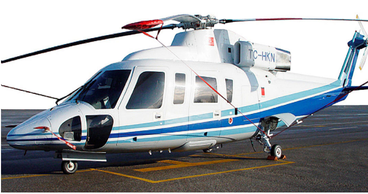
S76 Blade Tie-Downs and Pitot Cover set