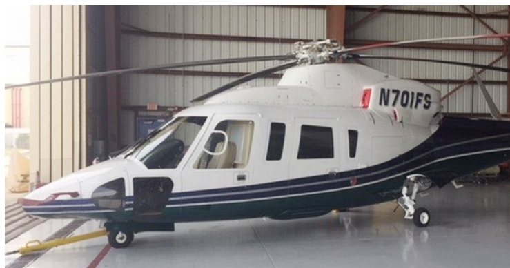
Sikorsky S76 (All Models) Intake Plugs (S76c Models)