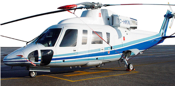
S76 Blade Tie-Downs and Pitot Cover set