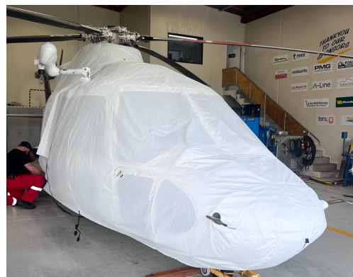
Sikorsky S76C Forward Canopy Cover, Engine Cover (test fit covers)