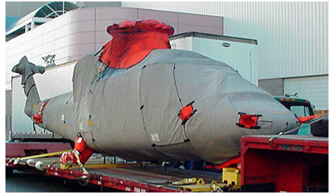
S76 Full Body Transport Cover