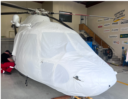
Sikorsky S76C Forward Canopy Cover, Engine Cover (test fit covers)

WINTER USE MATERIAL - Made with Solution-Dyed Polyester fabric, this option is intended for seasonal use to aid in deicing, rain mitigation, or for occasional travel. The material is lighter and more compact, but more susceptible to UV damage and may have a shorter useful life if used continuously outside than the all-year use material.