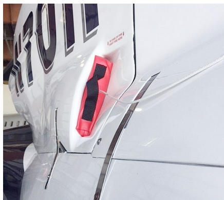
Sikorsky S76 (All Models) Intake Plugs (S76c Models)

The Engine Inlet Plugs are custom fit for your Sikorsky S76 (All Models) intakes, made with heavy-duty vinyl material, and stuffed with a single block of sculpted urethane foam. Each plug has a zipper that allows the foam to be removed and dried if necessary. Engine plugs have 'Remove Before Flight' streamers sewn onto the face of the plugs. Most plugs are imprinted with the aircraft registration number in black for an extra charge. Storage bag NOT included. Engine plugs may be inserted after flight when the engine is still warm. Engine Inlet Plugs are commonly referred to as Cowl Plugs, Intake Plugs, Cowl Blocks, Engine Blocks, and Engine Bungs.