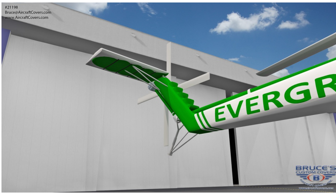
Sikorsky S-64 Canopy/Nose, Engine Area, Blade, Rotor, Tail Rotor Sikorsky S-64 Skycrane, CH-54 Tarhe Insulated Engine, Rotor Hub, Tailboom, Stabilizer & Tail Rotor Covers (illustration)

The Tailboom Cover details vary by model, but generally the helicopter tail boom cover encloses the tail boom from the "bottleneck" to the aft end. They usually also cover the horizontal stabilizers, and are custom made to allow for antennae, lights, and other protrusions. They attach with straps underneath the tail boom. Covers for the vertical and horizontal stabilizers are also available separately. Specific information for each model is available on request.