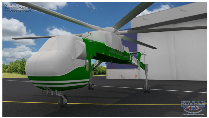
Sikorsky S-64 Canopy/Nose, Engine Area, Blade, Rotor, Tail Rotor Covers (illustration)