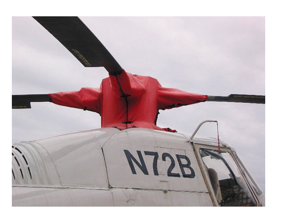
Sikorsky S58 Rotor Hub Cover