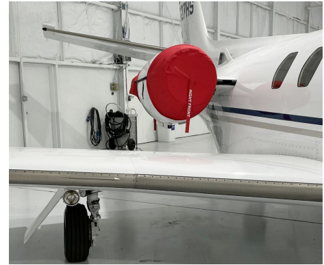
Cessna Citation S550 Intake/Exhaust Covers