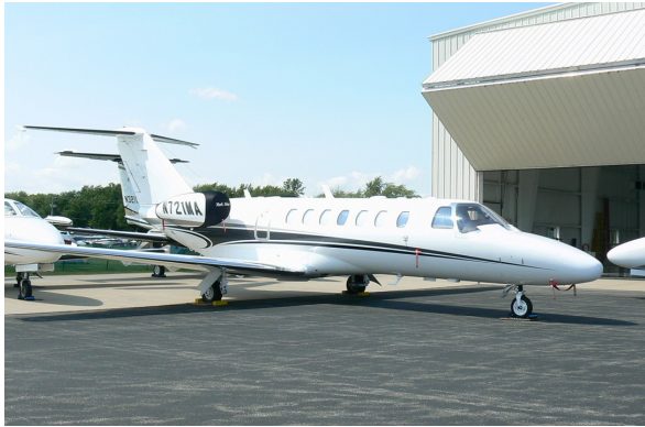
Cessna Citation CJ3 Bikini Style Engine Covers

and dried if necessary. Engine plugs have 'remove before flight' streamers sewn onto the face of the plugs. Most plugs are imprinted with the aircraft registration number in black. Engine plugs may be inserted after flight when the engine is still warm. Engine Inlet Plugs are commonly referred to as Cowl Plugs, Intake Plugs, Cowl Blocks, Engine Blocks, and Engine Bungs.