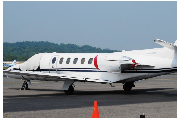
Cessna Citation S2 Cockpit Cover, Intake Covers & Exhaust Plugs