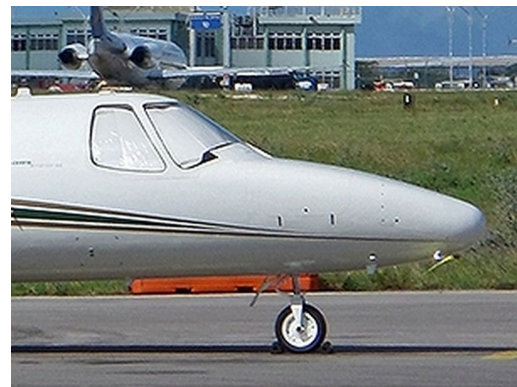
Cessna Citation S550 Cockpit HeatShields