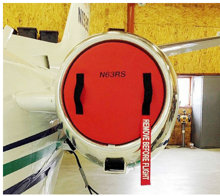
Cessna Citation S-550 Intake Plugs