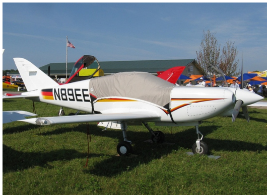
The Swearingen SX300 Canopy Cover