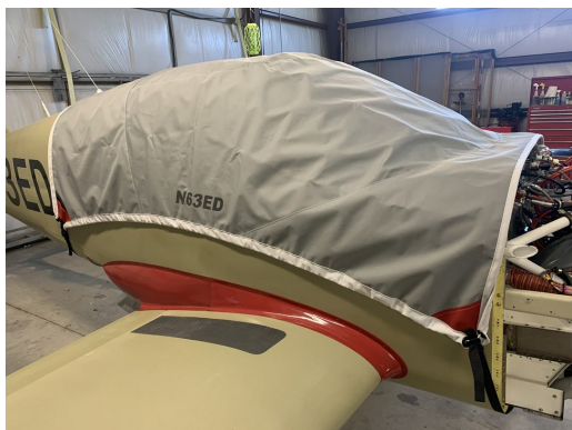
Swearingen SX300 Travel Weight Canopy Cover

Travel Covers are made with Silver Solution-Dyed Polyester fabric and only lined over the windshield to save weight. The material is lightweight and more compact for easy stowage in the aircraft. The polyester material is water resistant, but only intended for occasional use outside. We also have an ultra lightweight material available for fitted hangar dust covers. For daily outdoor use, the non-travel Sunbrella Cover is the best choice.