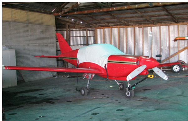
The Swearingen SX300 Canopy Cover