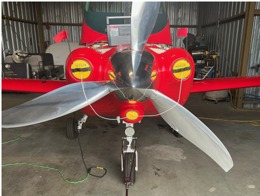
Swearingen SX-300 Engine Plugs

Engine Inlet Plugs are custom fit for your Swearingen SX300 intakes, made with heavy-duty vinyl material, and stuffed with a single block of sculpted urethane foam. Each plug has a zipper that allows the foam to be removed and dried if necessary. Engine plugs have warning flags that are visible from the cockpit or 'remove before flight' streamers sewn onto the face of the plugs. Most plugs are imprinted with the aircraft registration number in black for an extra charge. Storage bag NOT included. Engine plugs may be inserted after flight when the engine is still warm. Engine Inlet Plugs are commonly referred to as Cowl Plugs, Intake Plugs, Cowl Blocks, Engine Blocks, and Engine Bungs.