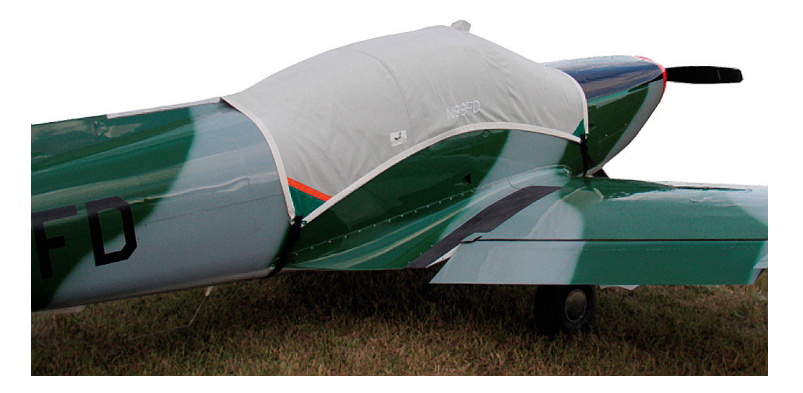
Standard Canopy Cover

This cover type is made from Silver Acrylic Sunbrella canvas and is 100% lined with a soft and smooth microfiber. Bruce's Custom Covers developed this material combination especially for aircraft protection. The outer material is medium weight and treated for water resistance, UV resistance and anti-static buildup. The inner lining is a very soft and smooth microfiber to prevent scratching. The material is very reflective, and tests show that the cabin interior temperature can be reduced to near-ambient temperature on the hottest of days. It is water, ice and snow repellent, yet breathable to allow moisture to escape from between the cover and the aircraft surface.