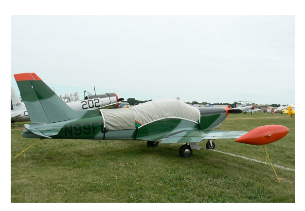
Siai Marchetti SF260 Canopy Cover with aft extension