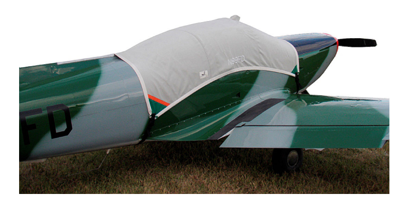
Siai Marchetti SF260 Light Weight Travel Canopy Cover