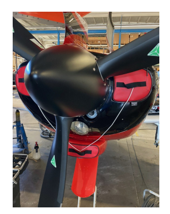
Siai Marchetti SF260 Engine Plugs

Engine Inlet Plugs are custom fit for your Siai Marchetti SF260 intakes, made with heavy-duty vinyl material, and stuffed with a single block of sculpted urethane foam. Each plug has a zipper that allows the foam to be removed and dried if necessary. Engine plugs have warning flags that are visible from the cockpit or 'remove before flight' streamers sewn onto the face of the plugs. Most plugs are imprinted with the aircraft registration number in black for an extra charge. Storage bag NOT included. Engine plugs may be inserted after flight when the engine is still warm. Engine Inlet Plugs are commonly referred to as Cowl Plugs, Intake Plugs, Cowl Blocks, Engine Blocks, and Engine Bungs.