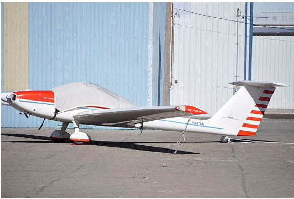
Grob 109 Canopy Cover

This cover type is made from Silver Acrylic Sunbrella canvas and is 100% lined with a soft and smooth microfiber. Bruce's Custom Covers developed this material combination especially for aircraft protection. The outer material is medium weight and treated for water resistance, UV resistance and anti-static buildup. The inner lining is a very soft and smooth microfiber to prevent scratching. The material is very reflective, and tests show that the cabin interior temperature can be reduced to near-ambient temperature on the hottest of days. It is water, ice and snow repellent, yet breathable to allow moisture to escape from between the cover and the aircraft surface.