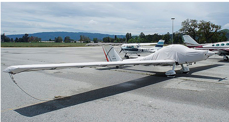
Lambda Canopy/Engine Cover and Wing Covers Grob 109 Canopy/Engine w/ extension to tail, Wing, Stabilizer & Prop/Spinner Covers