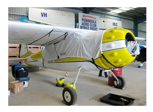
Cessna 195 Canopy Cover, over-top, 24" fwd ext to cover cowl ring gap, gas cap ext.

The material is very reflective, and tests show that the cabin interior temperature can be reduced to near-ambient temperature on the hottest of days. It is water, ice and snow repellent, yet breathable to allow moisture to escape from between the cover and the aircraft surface.