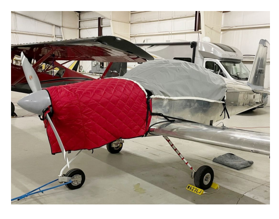
Vans RV-7 Travel Canopy Cover, Hangar Blanket