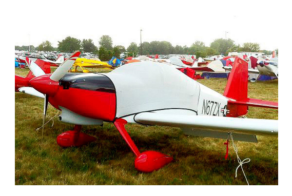
Light Weight Fitted Hangar Dust Cover

lightweight and more compact for easy stowage in the aircraft. The polyester material is water resistant, but only intended for occasional use outside. We also have an ultra lightweight material available for fitted hangar dust covers. For daily outdoor use, the non-travel Sunbrella Cover is the best choice.