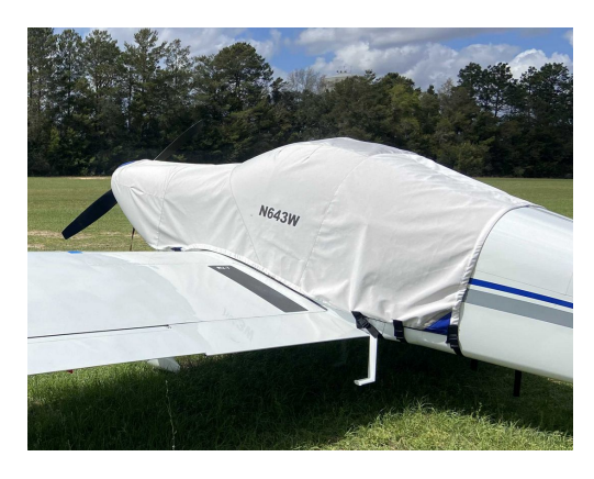
Van's RV-7 Extended Canopy/Engine Cover

This cover type is made from Silver Acrylic Sunbrella canvas and is 100% lined with a soft and smooth microfiber. Bruce's Custom Covers developed this material combination especially for aircraft protection. The outer material is medium weight and treated for water resistance, UV resistance and anti-static buildup. The inner lining is a very soft and smooth microfiber to prevent scratching. The material is very reflective, and tests show that the cabin interior temperature can be reduced to near-ambient temperature on the hottest of days. It is water, ice and snow repellent, yet breathable to allow moisture to escape from between the cover and the aircraft surface.