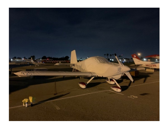
Van's RV-9A Complete Fuselage Cover with Detachable Wing Covers