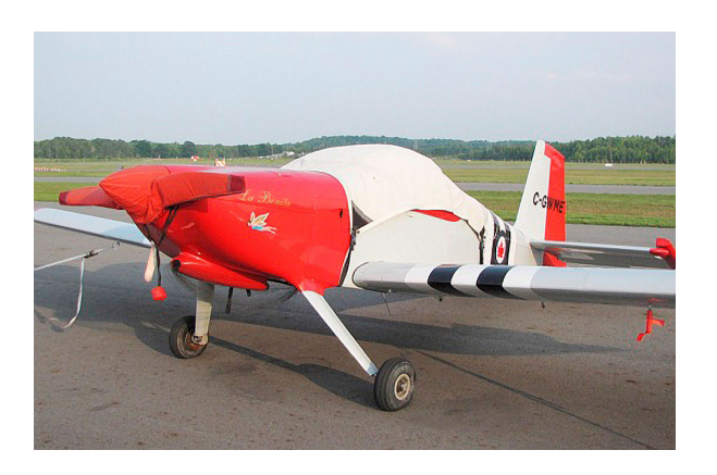
Van's RV-6 2-Blade Prop Cover