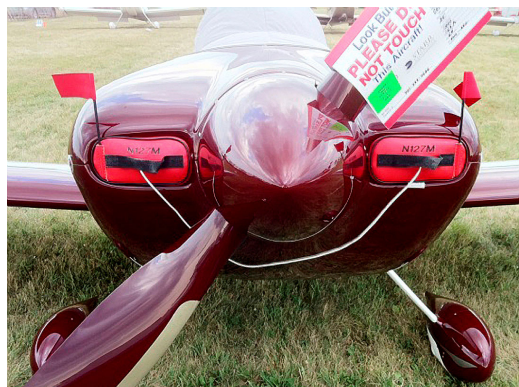
Van's RV-8 Engine Inlet Plugs

Engine Inlet Plugs are custom fit for your Van's Aircraft RV-8/8A intakes, made with heavy-duty vinyl material, and stuffed with a single block of sculpted urethane foam. Each plug has a zipper that allows the foam to be removed and dried if necessary. Engine plugs have warning flags that are visible from the cockpit or 'remove before flight' streamers sewn onto the face of the plugs. Most plugs are imprinted with the aircraft registration number in black for an extra charge. Storage bag NOT included. Engine plugs may be inserted after flight when the engine is still warm. Engine Inlet Plugs are commonly referred to as Cowl Plugs, Intake Plugs, Cowl Blocks, Engine Blocks, and Engine Bungs.