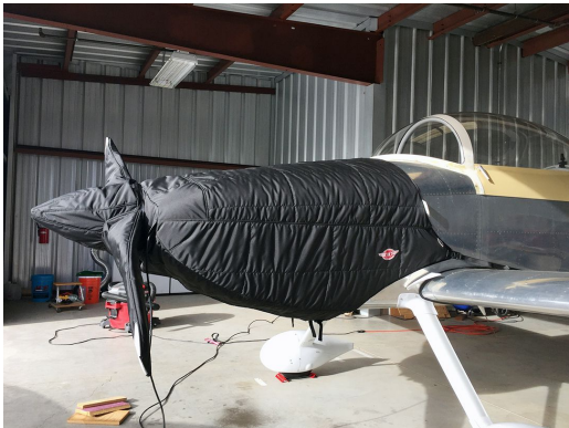
Van's RV-8 Insulated Prop and Engine Covers (sold separately)