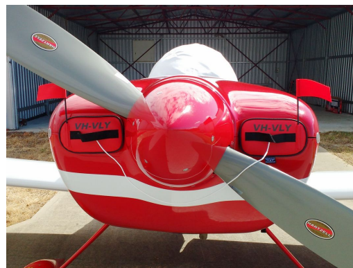
Van's RV-8 Engine Inlet Plugs