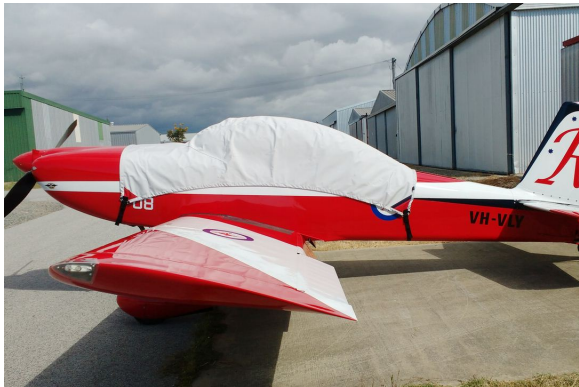
Van's RV-8 Belly Strap Type Canopy Cover