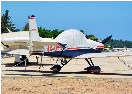
Van's RV-8 Canopy Cover

This cover type is made from Silver Acrylic Sunbrella canvas and is 100% lined with a soft and smooth microfiber. Bruce's Custom Covers developed this material combination especially for aircraft protection. The outer material is medium weight and treated for water resistance, UV resistance and anti-static buildup. The inner lining is a very soft and smooth microfiber to prevent scratching. The material is very reflective, and tests show that the cabin interior temperature can be reduced to near-ambient temperature on the hottest of days. It is water, ice and snow repellent, yet breathable to allow moisture to escape from between the cover and the aircraft surface.