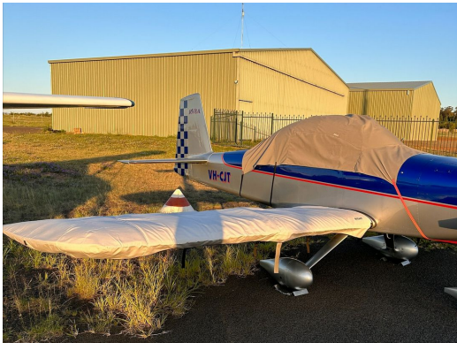
Van's Aircraft RV-8/8A Wing Covers, All Year Use

WINTER USE MATERIAL - Made with Solution-Dyed Polyester fabric, this option is intended for seasonal use to aid in deicing, rain mitigation, or for occasional travel. The material is lighter and more compact, but more susceptible to UV damage and may have a shorter useful life if used continuously outside than the all-year use material.