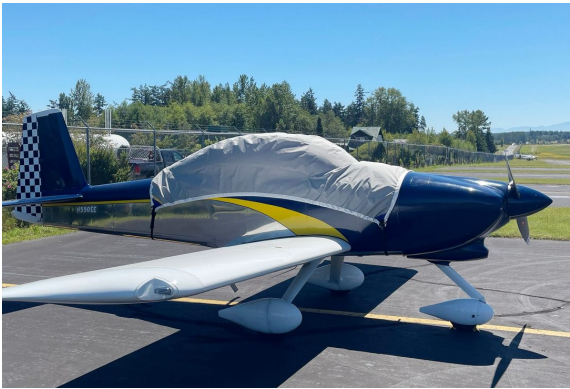
RV-8A Travel Canopy Cover

Travel Covers are made with Silver Solution-Dyed Polyester fabric and only lined over the windshield to save weight. The material is lightweight and more compact for easy stowage in the aircraft. The polyester material is water resistant, but only intended for occasional use outside. We also have an ultra lightweight material available for fitted hangar dust covers. For daily outdoor use, the non-travel Sunbrella Cover is the best choice.