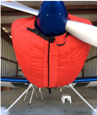
Van's RV-8 Insulated Engine Cover with Oil Filler Preheater access flap

This cover type is made from Silver Acrylic Sunbrella canvas and is 100% lined with a soft and smooth microfiber. Bruce's Custom Covers developed this material combination especially for aircraft protection. The outer material is medium weight and treated for water resistance, UV resistance and anti-static buildup. The inner lining is a very soft and smooth microfiber to prevent scratching. The material is very reflective, and tests show that the cabin interior temperature can be reduced to near-ambient temperature on the hottest of days. It is water, ice and snow repellent, yet breathable to allow moisture to escape from between the cover and the aircraft surface.