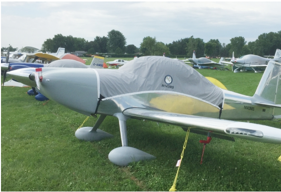
Van's Aircraft RV-8 Travel Cover, Light Weight Travel Canopy Cover