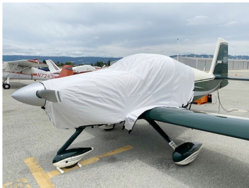
Van's RV-9A Extended Canopy/Engine Cover

This cover type is made from Silver Acrylic Sunbrella canvas and is 100% lined with a soft and smooth microfiber. Bruce's Custom Covers developed this material combination especially for aircraft protection. The outer material is medium weight and treated for water resistance, UV resistance and anti-static buildup. The inner lining is a very soft and smooth microfiber to prevent scratching. The material is very reflective, and tests show that the cabin interior temperature can be reduced to near-ambient temperature on the hottest of days. It is water, ice and snow repellent, yet breathable to allow moisture to escape from between the cover and the aircraft surface.