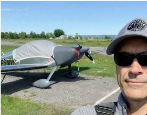
Van's RV-7 Travel Cover, Light Weight Canopy Cover