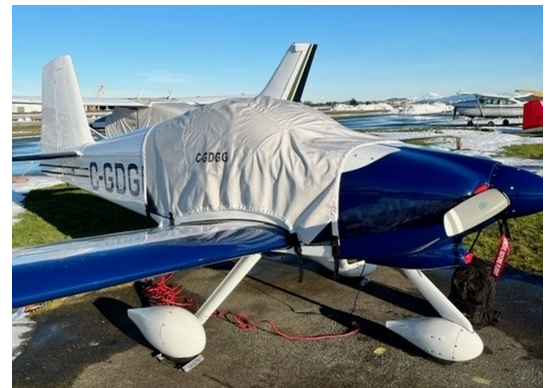
Van's RV-7A extended canopy cover