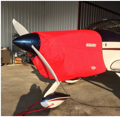
Van's RV-9A Insulated Engine Cover