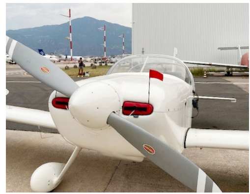
Van's RV7/7A Engine Inlet Plugs