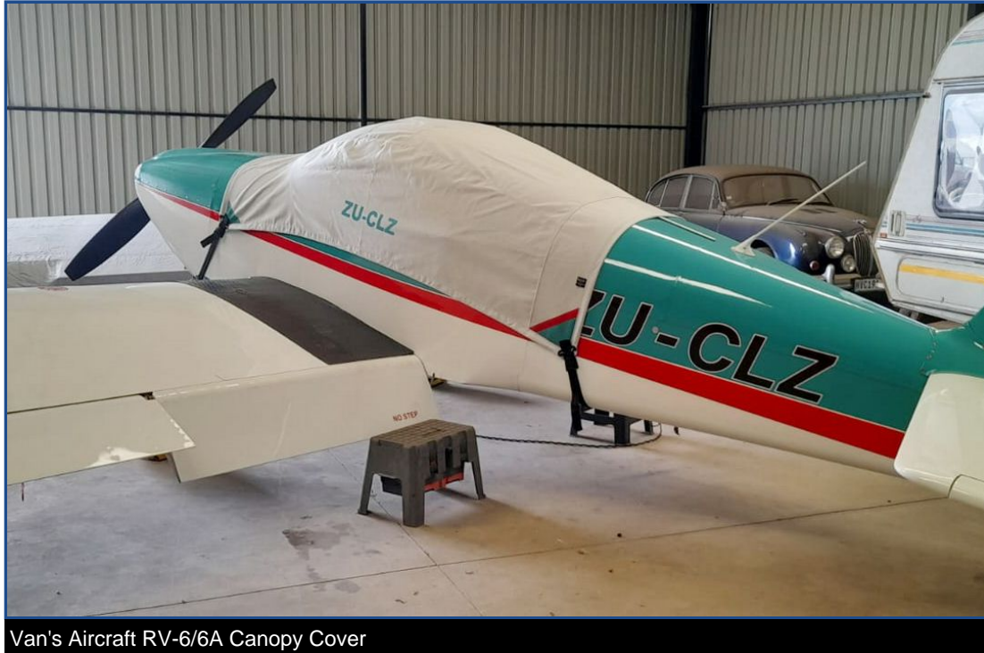
Van's Aircraft RV-6/6A Canopy Cover