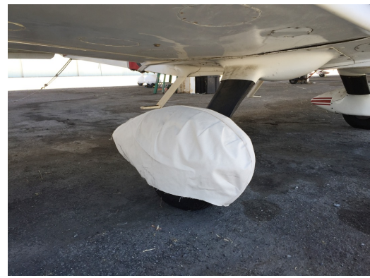
Grumman AA5 Main Wheelpant Cover, test fit