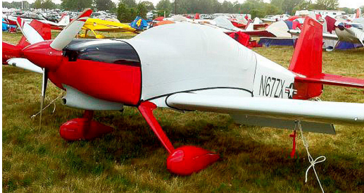
Light Weight Fitted Hangar Dust Cover

Travel Covers are made with Silver Solution-Dyed Polyester fabric and only lined over the windshield to save weight. The material is lightweight and more compact for easy stowage in the aircraft. The polyester material is water resistant, but only intended for occasional use outside. We also have an ultra lightweight material available for fitted hangar dust covers. For daily outdoor use, the non-travel Sunbrella Cover is the best choice.