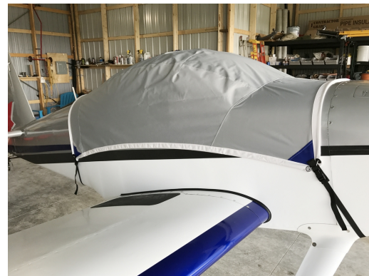
Van's Aircraft RV-9 Travel Cover, Light Weight Travel Canopy Cover