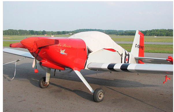
Van's RV-6 2-Blade Prop Cover