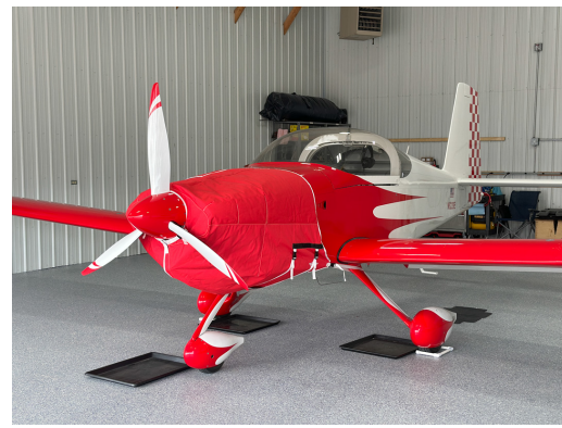
Van's RV-9A Insulated Engine Cover with oil door access