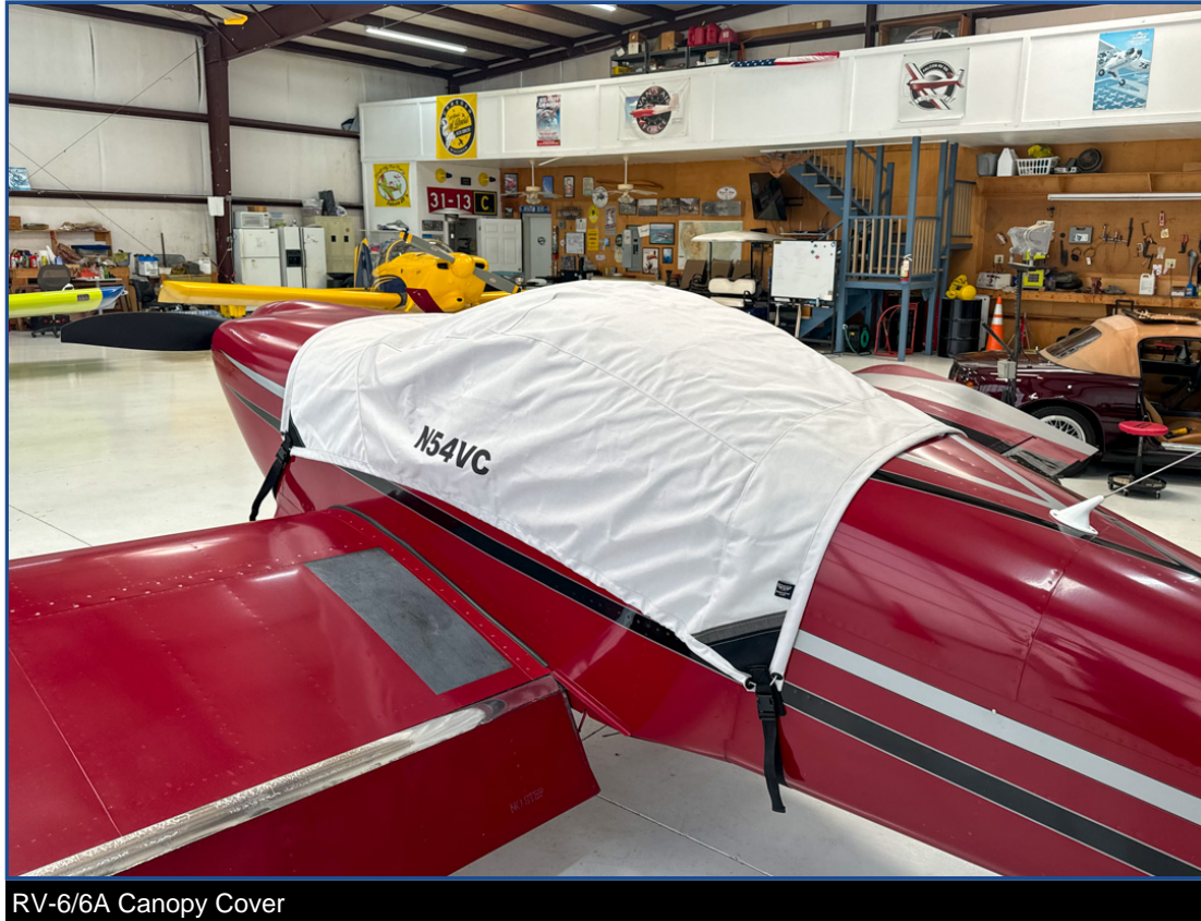
RV-6/6A Canopy Cover