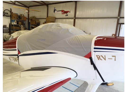
Van's RV-7 Travel Canopy Cover