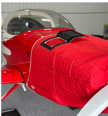
Van's RV-9A Insulated Engine Cover with oil door access