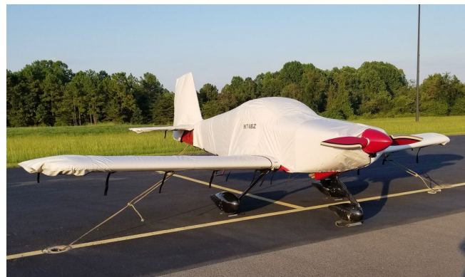
Van's RV-7A Complete Cover Set