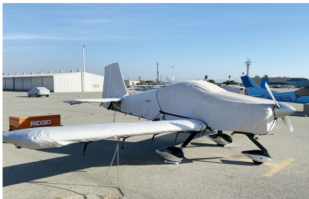
Van's RV-9A Extended Canopy/Engine, Wing & Empennage Covers