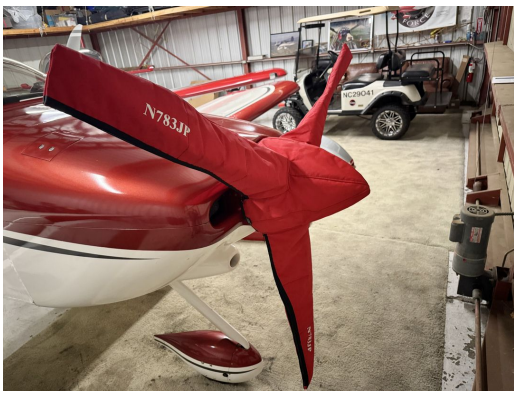
Van's RV-9 Insulated Prop Cover, 3-Blade