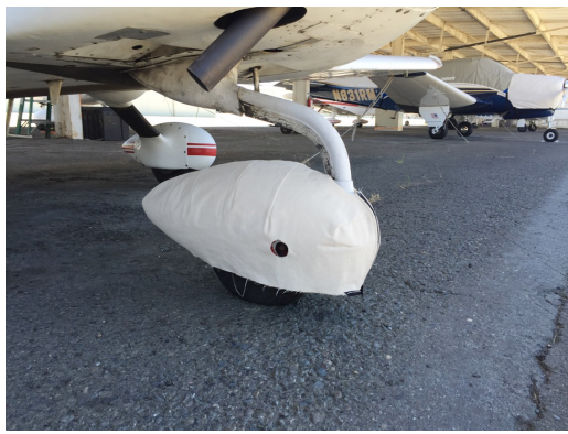
Grumman AA5 Nose Wheelpant Cover, test fit