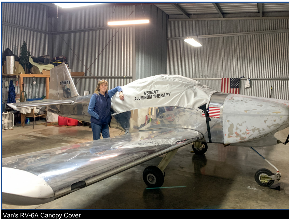
Van's RV-6A Canopy Cover