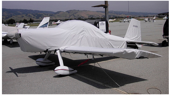
Van's RV-8 Complete Fuselage Cover w/ Detachable Wing Covers & Prop Cover