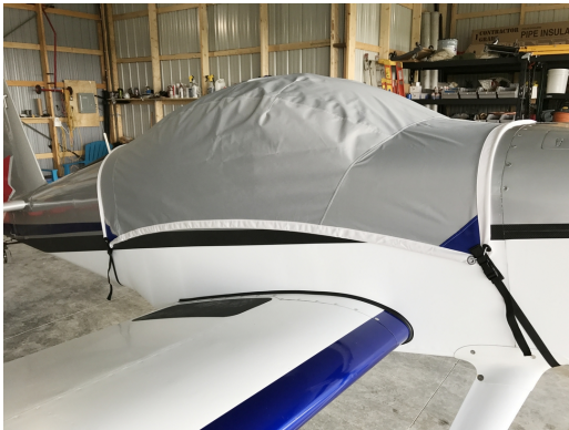
Van's Aircraft RV-9 Travel Cover, Light Weight Travel Canopy Cover

Travel Covers are made with Silver Solution-Dyed Polyester fabric and only lined over the windshield to save weight. The material is lightweight and more compact for easy stowage in the aircraft. The polyester material is water resistant, but only intended for occasional use outside. We also have an ultra lightweight material available for fitted hangar dust covers. For daily outdoor use, the non-travel Sunbrella Cover is the best choice.