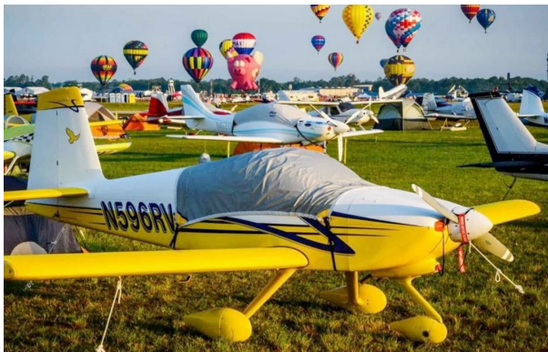
Vans's RV-9 Travel Weight Canopy Cover at Sun 'n Fun

Travel Covers are made with Silver Solution-Dyed Polyester fabric and only lined over the windshield to save weight. The material is lightweight and more compact for easy stowage in the aircraft. The polyester material is water resistant, but only intended for occasional use outside. We also have an ultra lightweight material available for fitted hangar dust covers. For daily outdoor use, the non-travel Sunbrella Cover is the best choice.