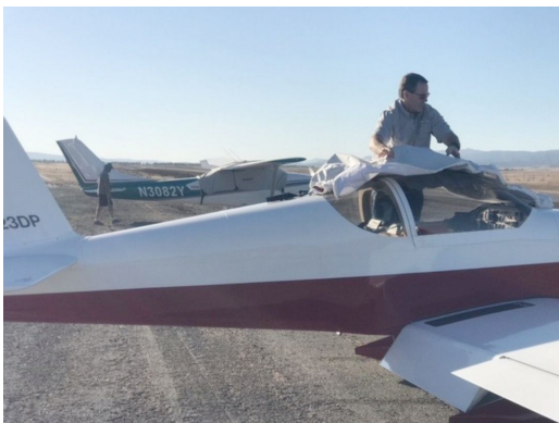
Van's RV-6A Canopy Cover

This cover type is made from Silver Acrylic Sunbrella canvas and is 100% lined with a soft and smooth microfiber. Bruce's Custom Covers developed this material combination especially for aircraft protection. The outer material is medium weight and treated for water resistance, UV resistance and anti-static buildup. The inner lining is a very soft and smooth microfiber to prevent scratching. The material is very reflective, and tests show that the cabin interior temperature can be reduced to near-ambient temperature on the hottest of days. It is water, ice and snow repellent, yet breathable to allow moisture to escape from between the cover and the aircraft surface.