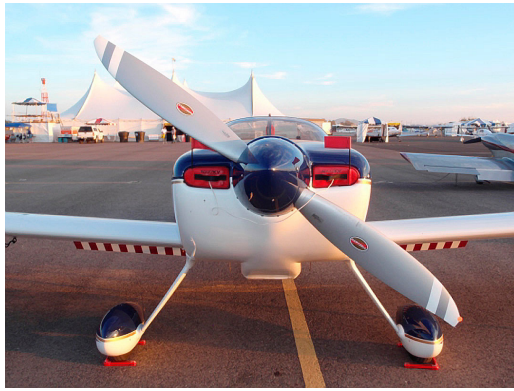
Van's RV-7 Engine Inlet Plugs