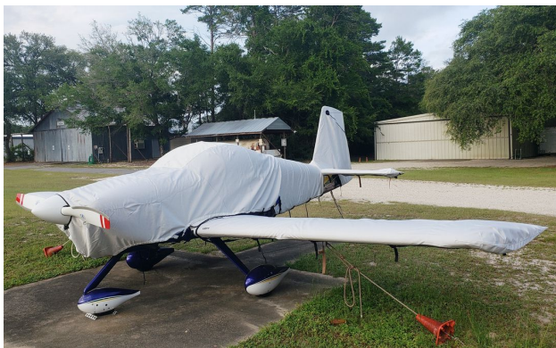
Van's RV-7A Cover Set

WINTER USE MATERIAL - Made with Solution-Dyed Polyester fabric, this option is intended for seasonal use to aid in deicing, rain mitigation, or for occasional travel. The material is lighter and more compact, but more susceptible to UV damage and may have a shorter useful life if used continuously outside than the all-year use material.