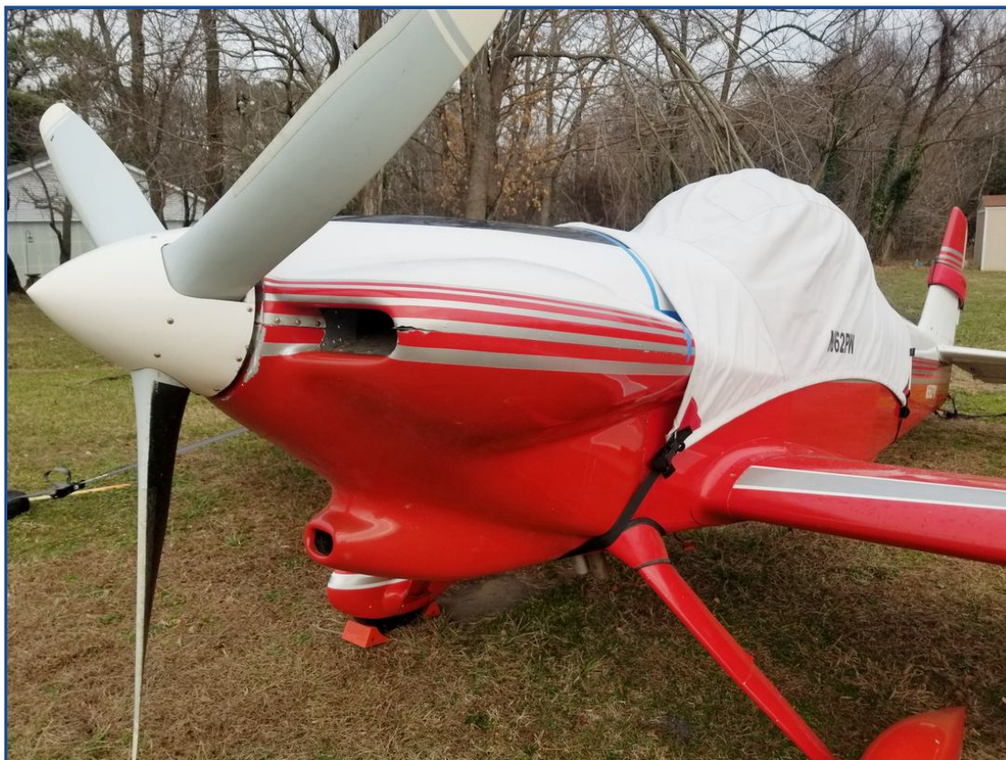
Vans RV-4 Canopy Cover