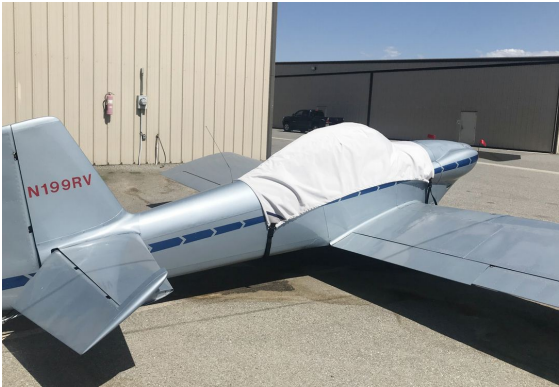
Van's RV-4 Canopy Cover

This cover type is made from Silver Acrylic Sunbrella canvas and is 100% lined with a soft and smooth microfiber. Bruce's Custom Covers developed this material combination especially for aircraft protection. The outer material is medium weight and treated for water resistance, UV resistance and anti-static buildup. The inner lining is a very soft and smooth microfiber to prevent scratching. The material is very reflective, and tests show that the cabin interior temperature can be reduced to near-ambient temperature on the hottest of days. It is water, ice and snow repellent, yet breathable to allow moisture to escape from between the cover and the aircraft surface.