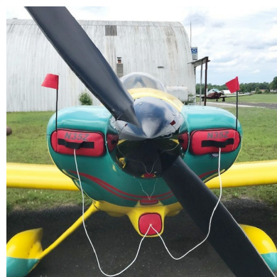
Van's Aircraft RV-4 Engine Inlet Plugs