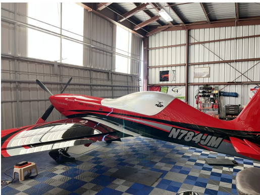
Gamebird GB-1 Solar Cap (single place), CUSTOM COVERS & IMPRINTING AVAILABLE!