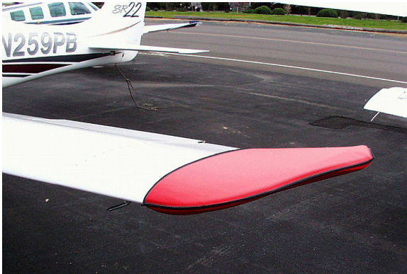
Cirrus SR-22 Wingtip Pad (also available for the Horiz. Stab.