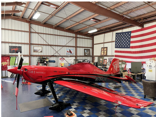
Gamebird GB-1 Solar Cap (single place), CUSTOM COVERS & IMPRINTING AVAILABLE!

Travel Covers are made with Silver Solution-Dyed Polyester fabric and only lined over the windshield to save weight. The material is lightweight and more compact for easy stowage in the aircraft. The polyester material is water resistant, but only intended for occasional use outside. We also have an ultra lightweight material available for fitted hangar dust covers. For daily outdoor use, the non-travel Sunbrella Cover is the best choice.