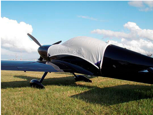
Harmon Rocket Canopy Cover