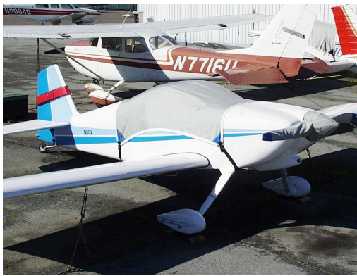
Vans's RV-6 Canopy Cover, Prop Cover