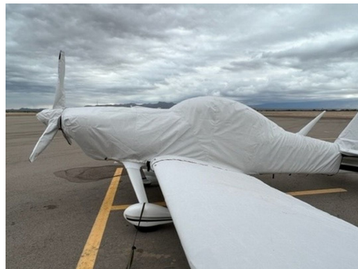
Vans RV-8 Complete Cover Set