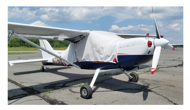
Glastar Over-Top Canopy Cover, Engine Plugs

Engine Inlet Plugs are custom fit for your Van's Aircraft RV-15 intakes, made with heavy-duty vinyl material, and stuffed with a single block of sculpted urethane foam. Each plug has a zipper that allows the foam to be removed and dried if necessary. Engine plugs have warning flags that are visible from the cockpit or 'remove before flight' streamers sewn onto the face of the plugs. Most plugs are imprinted with the aircraft registration number in black for an extra charge. Storage bag NOT included. Engine plugs may be inserted after flight when the engine is still warm. Engine Inlet Plugs are commonly referred to as Cowl Plugs, Intake Plugs, Cowl Blocks, Engine Blocks, and Engine Bungs.