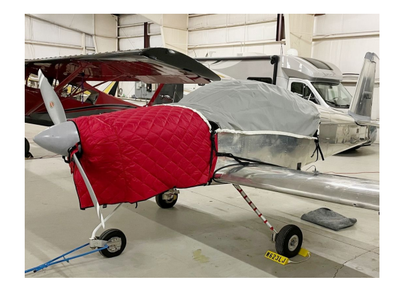
Vans RV-7 Travel Canopy Cover, Hangar Blanket