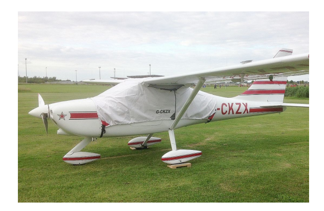
Glasair Aviation Glastar, Sportsman 2+2 Canopy Cover (Over-The-Top Style)