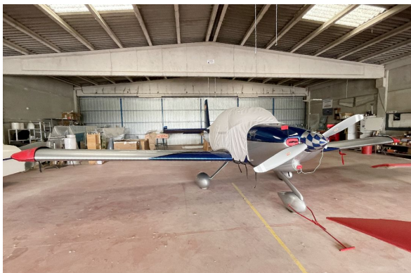
Van's RV-10 Extended Canopy Cover, Wingtip Pads, Engine Plugs

Designed to prevent damage to the aircraft extremities in crowded hangars, these products are made of bright red Naugahyde and thickly padded with a sandwich of closed cell foam.