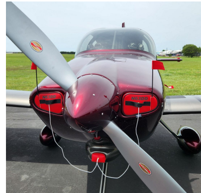
RV-10 Engine Inlet Plugs