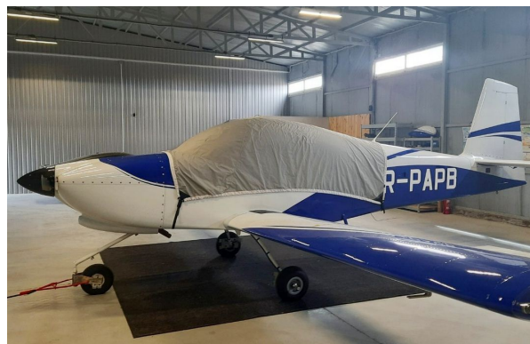
Van's RV-10 Travel Weight Canopy Cover