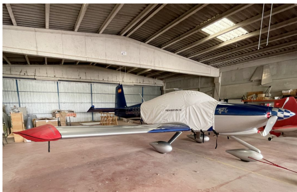
Van's RV-10 Extended Canopy Cover, Wingtip Pads

Engine Inlet Plugs are custom fit for your Van's Aircraft RV-10 intakes, made with heavy-duty vinyl material, and stuffed with a single block of sculpted urethane foam. Each plug has a zipper that allows the foam to be removed and dried if necessary. Engine plugs have warning flags that are visible from the cockpit or 'remove before flight' streamers sewn onto the face of the plugs. Most plugs are imprinted with the aircraft registration number in black for an extra charge. Storage bag NOT included. Engine plugs may be inserted after flight when the engine is still warm. Engine Inlet Plugs are commonly referred to as Cowl Plugs, Intake Plugs, Cowl Blocks, Engine Blocks, and Engine Bungs.