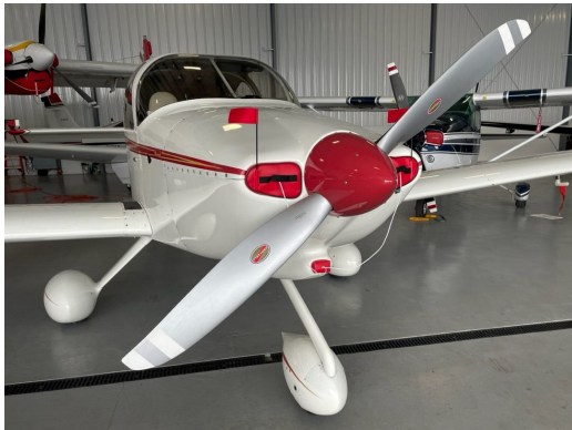
Van's RV-10 Engine Inlet Plugs

Engine Inlet Plugs are custom fit for your Van's Aircraft RV-10 intakes, made with heavy-duty vinyl material, and stuffed with a single block of sculpted urethane foam. Each plug has a zipper that allows the foam to be removed and dried if necessary. Engine plugs have warning flags that are visible from the cockpit or 'remove before flight' streamers sewn onto the face of the plugs. Most plugs are imprinted with the aircraft registration number in black for an extra charge. Storage bag NOT included. Engine plugs may be inserted after flight when the engine is still warm. Engine Inlet Plugs are commonly referred to as Cowl Plugs, Intake Plugs, Cowl Blocks, Engine Blocks, and Engine Bungs.