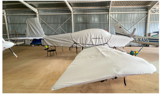
Van's RV-10 Full Cover Set