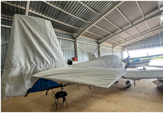
Van's RV-10 Full Cover Set