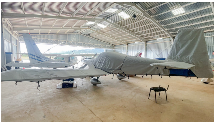
Van's RV-10 Full Cover Set

This cover type is made from Silver Acrylic Sunbrella canvas and is 100% lined with a soft and smooth microfiber. Bruce's Custom Covers developed this material combination especially for aircraft protection. The outer material is medium weight and treated for water resistance, UV resistance and anti-static buildup. The inner lining is a very soft and smooth microfiber to prevent scratching. The material is very reflective, and tests show that the cabin interior temperature can be reduced to near-ambient temperature on the hottest of days. It is water, ice and snow repellent, yet breathable to allow moisture to escape from between the cover and the aircraft surface.