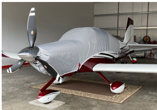
Van's RV-10 Travel Cover

Travel Covers are made with Silver Solution-Dyed Polyester fabric and only lined over the windshield to save weight. The material is lightweight and more compact for easy stowage in the aircraft. The polyester material is water resistant, but only intended for occasional use outside. We also have an ultra lightweight material available for fitted hangar dust covers. For daily outdoor use, the non-travel Sunbrella Cover is the best choice.