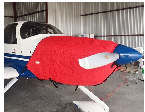
Van's RV-10 Insulated Engine Cover