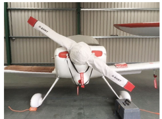
Van's RV-6 Prop/Spinner Cover