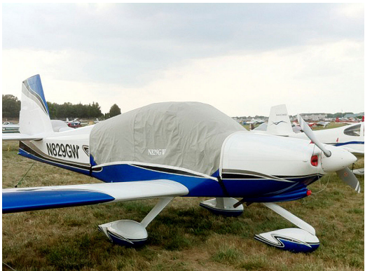
Van's RV-10 Canopy Cover & Engine Inlet Plugs