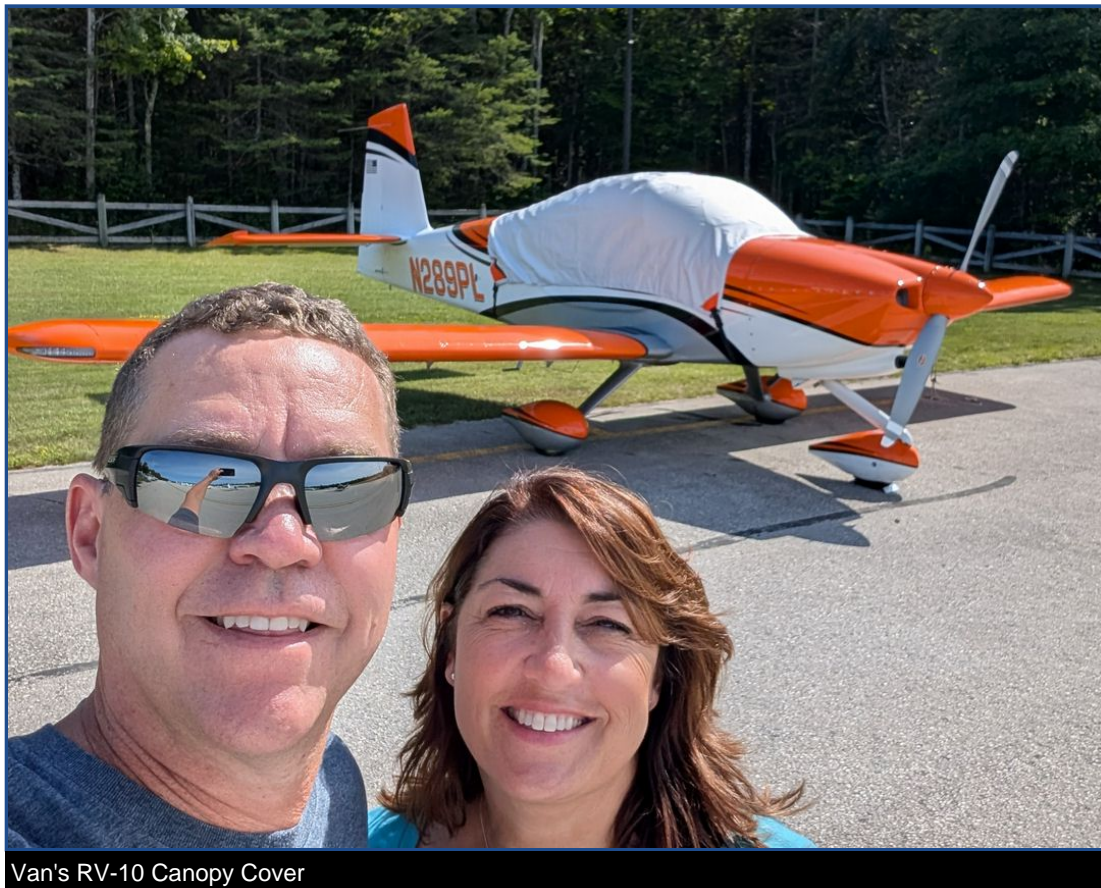
Van's RV-10 Canopy Cover