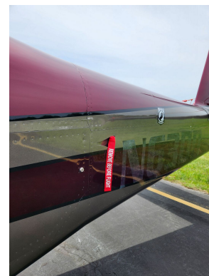
RV-10 Air Vent Wedge Plugs