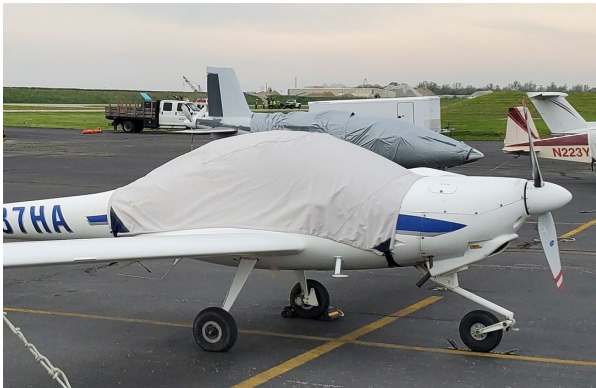
Diamond DA-20 Katana

This cover type is made from Silver Acrylic Sunbrella canvas and is 100% lined with a soft and smooth microfiber. Bruce's Custom Covers developed this material combination especially for aircraft protection. The outer material is medium weight and treated for water resistance, UV resistance and anti-static buildup. The inner lining is a very soft and smooth microfiber to prevent scratching. The material is very reflective, and tests show that the cabin interior temperature can be reduced to near-ambient temperature on the hottest of days. It is water, ice and snow repellent, yet breathable to allow moisture to escape from between the cover and the aircraft surface.