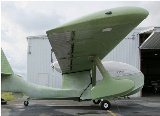
Republic Seabee Canopy Cover