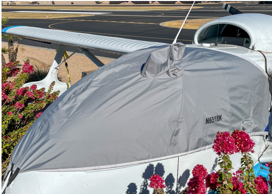
Seabee Amphibian Travel Cover, Light Weight Canopy Cover