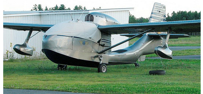
Seabee Canopy Cover