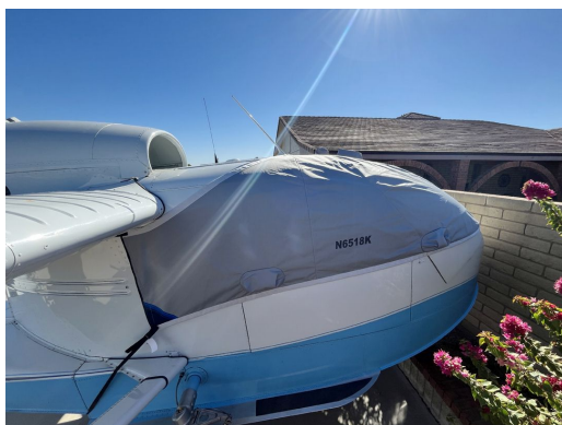
Seabee Amphibian Travel Cover, Light Weight Canopy Cover

This cover type is made from Silver Acrylic Sunbrella canvas and is 100% lined with a soft and smooth microfiber. Bruce's Custom Covers developed this material combination especially for aircraft protection. The outer material is medium weight and treated for water resistance, UV resistance and anti-static buildup. The inner lining is a very soft and smooth microfiber to prevent scratching. The material is very reflective, and tests show that the cabin interior temperature can be reduced to near-ambient temperature on the hottest of days. It is water, ice and snow repellent, yet breathable to allow moisture to escape from between the cover and the aircraft surface.