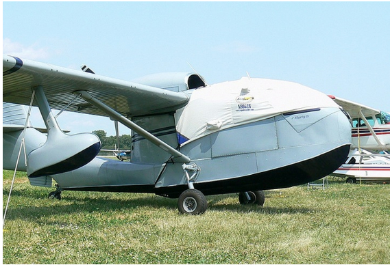
Republic Seabee Canopy Cover

The material is very reflective, and tests show that the cabin interior temperature can be reduced to near-ambient temperature on the hottest of days. It is water, ice and snow repellent, yet breathable to allow moisture to escape from between the cover and the aircraft surface.