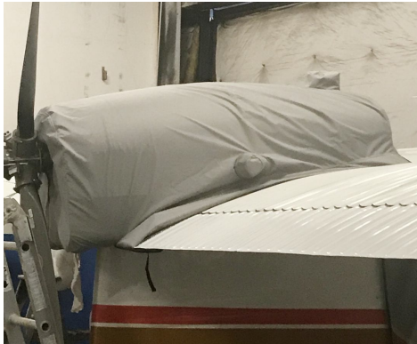
Republic Seabee Amphibian Engine Cover