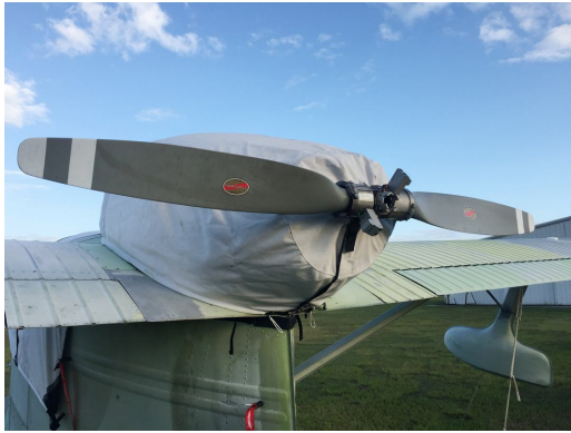
Republic Seabee Engine Cover

water resistance, UV resistance and anti-static buildup. The inner lining is a very soft and smooth microfiber to prevent scratching. The material is very reflective, and tests show that the cabin interior temperature can be reduced to near-ambient temperature on the hottest of days. It is water, ice and snow repellent, yet breathable to allow moisture to escape from between the cover and the aircraft surface.