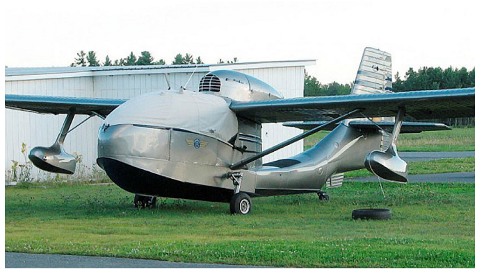
Seabee Canopy Cover