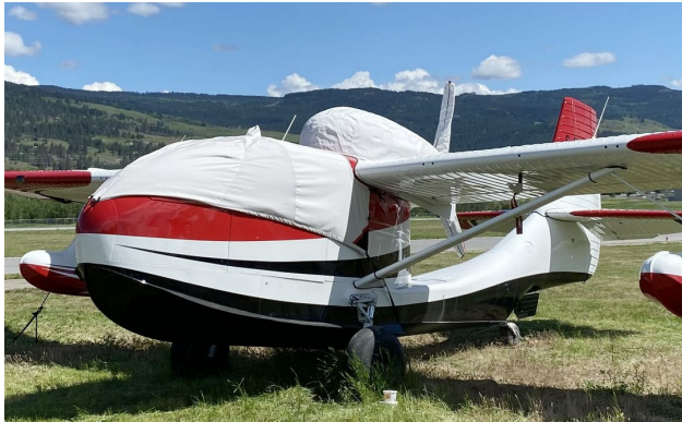
Republic Seabee Canopy, Engine, Prop Cover (5-blade)

water resistance, UV resistance and anti-static buildup. The inner lining is a very soft and smooth microfiber to prevent scratching. The material is very reflective, and tests show that the cabin interior temperature can be reduced to near-ambient temperature on the hottest of days. It is water, ice and snow repellent, yet breathable to allow moisture to escape from between the cover and the aircraft surface.