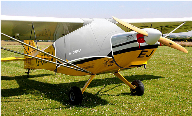
Rans Canopy Cover & Engine Plugs (illustration on a Rans S-7)

This cover type is made from Silver Acrylic Sunbrella canvas and is 100% lined with a soft and smooth microfiber. Bruce's Custom Covers developed this material combination especially for aircraft protection. The outer material is medium weight and treated for water resistance, UV resistance and anti-static buildup. The inner lining is a very soft and smooth microfiber to prevent scratching. The material is very reflective, and tests show that the cabin interior temperature can be reduced to near-ambient temperature on the hottest of days. It is water, ice and snow repellent, yet breathable to allow moisture to escape from between the cover and the aircraft surface.