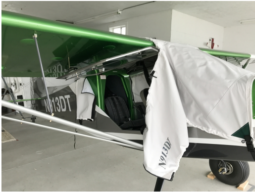
Rans S-7 Courier Canopy Cover (Over-The-Top Style), Belly Strap Type, Lsa Model (S7-S)