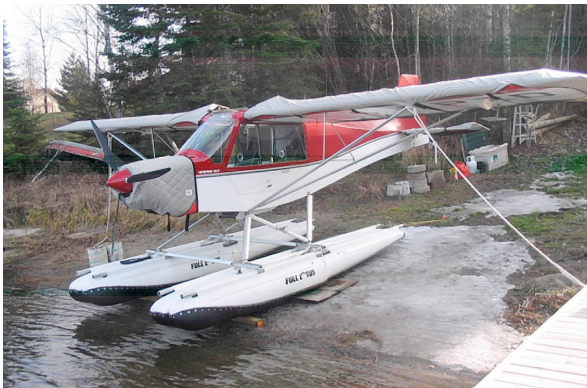
Rans S-7 Insulated Engine, Wing and Horizontal Stabilizer Covers FOR INTERIOR USE. Cub Crafters CC-11 Insulated Hangar Blanket, available in Red or Silver

This cover type is made from Silver Acrylic Sunbrella canvas and is 100% lined with a soft and smooth microfiber. Bruce's Custom Covers developed this material combination especially for aircraft protection. The outer material is medium weight and treated for water resistance, UV resistance and anti-static buildup. The inner lining is a very soft and smooth microfiber to prevent scratching. The material is very reflective, and tests show that the cabin interior temperature can be reduced to near-ambient temperature on the hottest of days. It is water, ice and snow repellent, yet breathable to allow moisture to escape from between the cover and the aircraft surface.