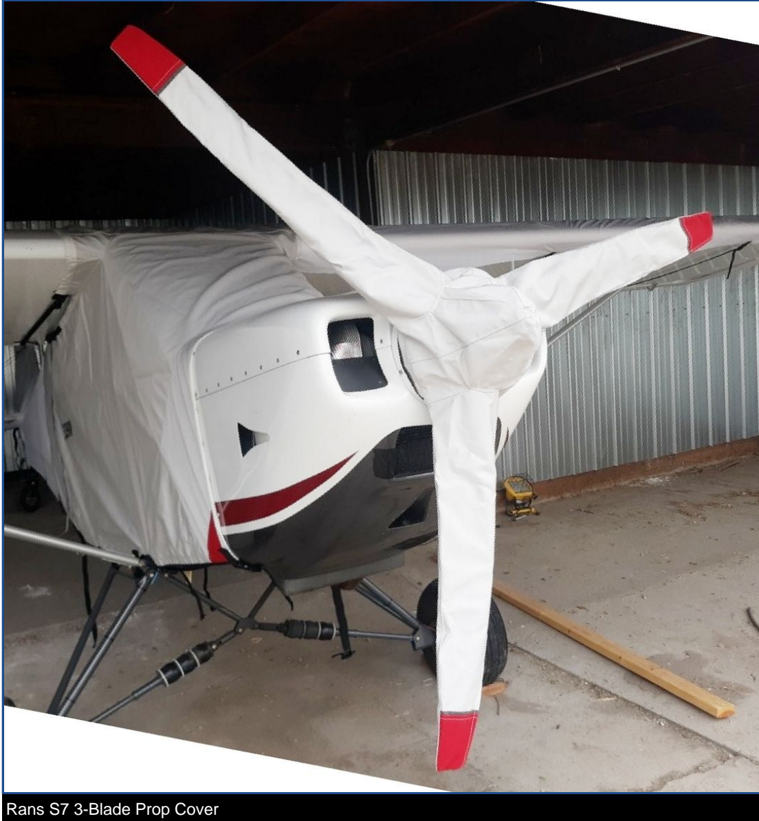
Rans S7 3-Blade Prop Cover