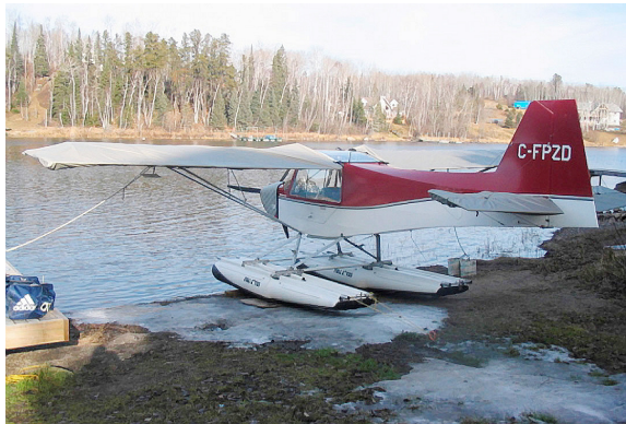
Rans S-7 Insulated Engine Cover, Wing Covers and Horizontal Stabilizer Covers

WINTER USE MATERIAL - Made with Solution-Dyed Polyester fabric, this option is intended for seasonal use to aid in deicing, rain mitigation, or for occasional travel. The material is lighter and more compact, but more susceptible to UV damage and may have a shorter useful life if used continuously outside than the all-year use material.