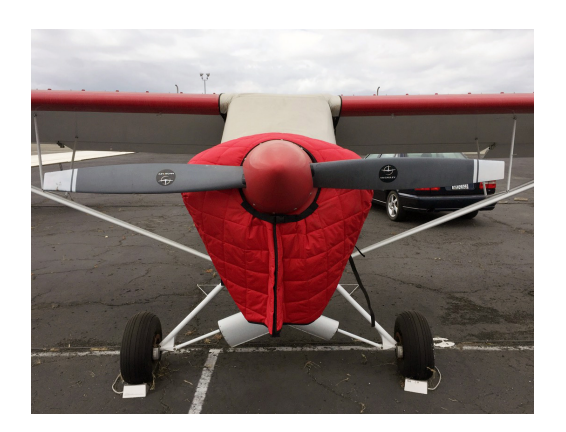
Rans S-7 Insulated Engine, Wing and Horizontal Stabilizer FOR INTERIOR USE. Cub Crafters CC-11 Insulated Hangar Blanket, Covers available in Red or Silver