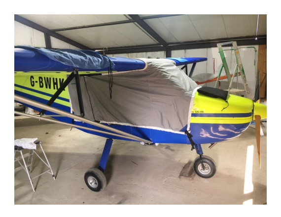
Rans S-6 Coyote Light Weight Travel Canopy Cover

lightweight and more compact for easy stowage in the aircraft. The polyester material is water resistant, but only intended for occasional use outside. We also have an ultra lightweight material available for fitted hangar dust covers. For daily outdoor use, the non-travel Sunbrella Cover is the best choice.