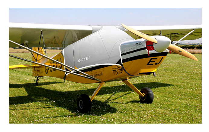
Rans Canopy Cover & Engine Plugs (illustration on a Rans S-7)