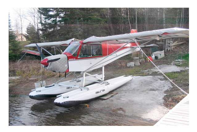
Rans S-7 Insulated Engine, Wing and Horizontal Stabilizer Covers

WINTER USE MATERIAL - Made with Solution-Dyed Polyester fabric, this option is intended for seasonal use to aid in deicing, rain mitigation, or for occasional travel. The material is lighter and more compact, but more susceptible to UV damage and may have a shorter useful life if used continuously outside than the all-year use material.