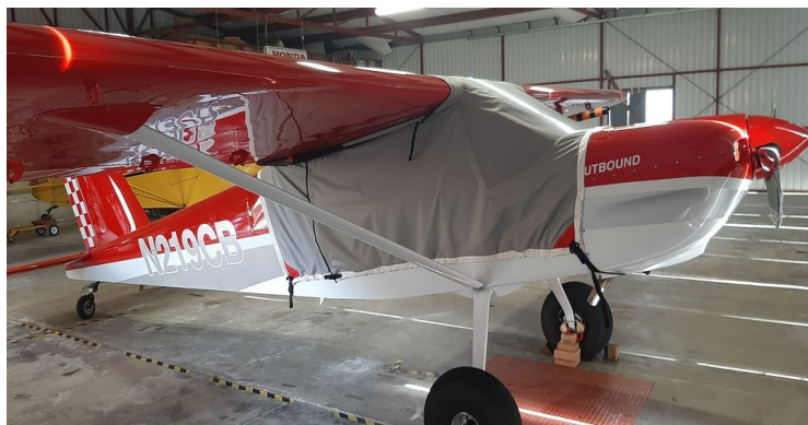
RANS S-21 Travel Weight Canopy Cover