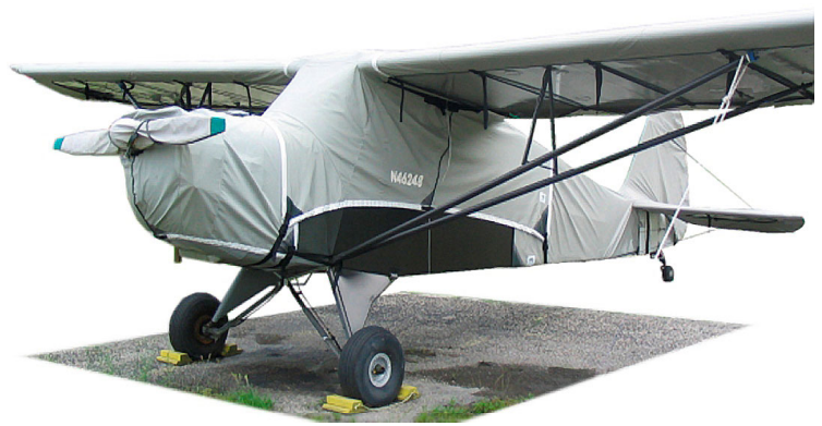
Prop Cover, Engine Cover, Canopy Cover, Wing Covers and Empennage Cover