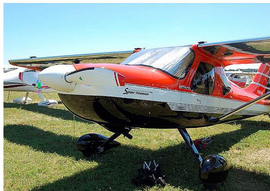
Glaster Sportsman Windshield HeatShield

Windshield Heatshields are interior sunshades for an aircraft's front windshield. The product is a unique composite of closed-cell foam with a silver mylar finish. The semi-rigid design is stiff enough to stand along the inside of the windshield using sun visors or window framing. It folds up flat and easily stores in the included storage sleeve. Some designs may require velcro and suction cups or split right and left sides. A Heatshield is an excellent short-term remedy for cockpit overheating. An external fabric cover is far more effective and practical for long-term protection.