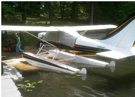
Glastar Sportsman Canopy Cover