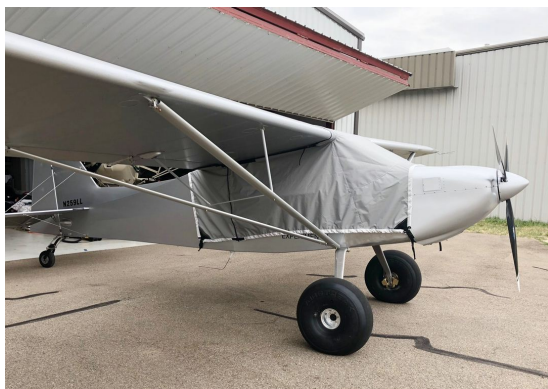
RANS S20 TRAVEL COVER

Travel Covers are made with Silver Solution-Dyed Polyester fabric and only lined over the windshield to save weight. The material is lightweight and more compact for easy stowage in the aircraft. The polyester material is water resistant, but only intended for occasional use outside. We also have an ultra lightweight material available for fitted hangar dust covers. For daily outdoor use, the non-travel Sunbrella Cover is the best choice.