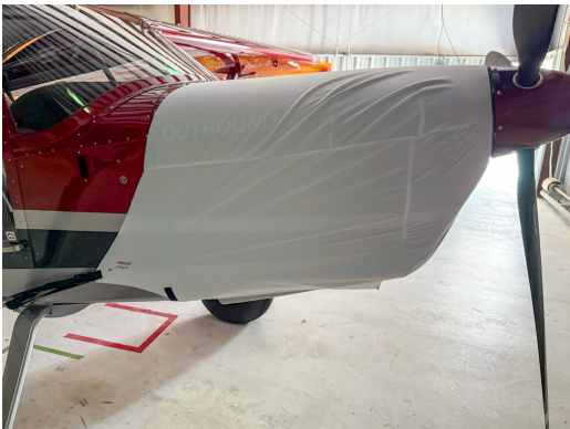
Rans S-21 Engine Cover, test fit cover