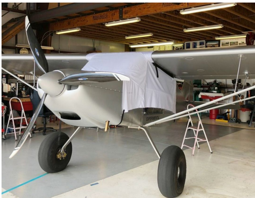
Rans S-20 Canopy Cover, test fit cover