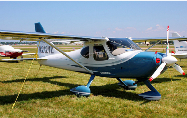
Glaster Sportsman Engine Inlet Plugs

Engine Inlet Plugs are custom fit for your Rans S-21 Outbound intakes, made with heavy-duty vinyl material, and stuffed with a single block of sculpted urethane foam. Each plug has a zipper that allows the foam to be removed and dried if necessary. Engine plugs have warning flags that are visible from the cockpit or 'remove before flight' streamers sewn onto the face of the plugs. Most plugs are imprinted with the aircraft registration number in black for an extra charge. Storage bag NOT included. Engine plugs may be inserted after flight when the engine is still warm. Engine Inlet Plugs are commonly referred to as Cowl Plugs, Intake Plugs, Cowl Blocks, Engine Blocks, and Engine Bungs.