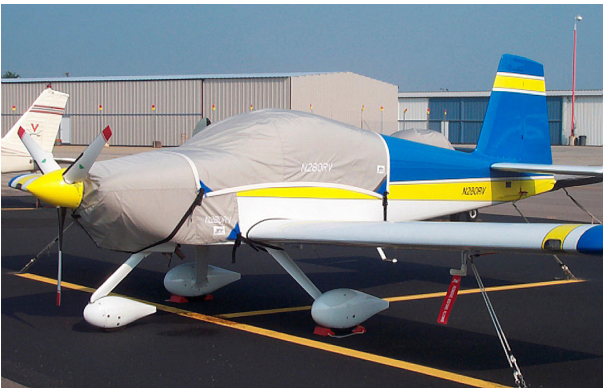
Van's RV-9 Canopy & Engine Covers