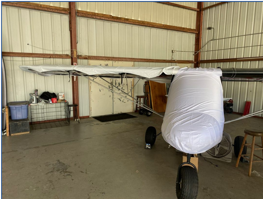
Rans S-12 Canopy/Nose &amp; Wing Covers, test fit