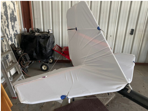
Rans S-12 Empennage Cover, test fit

WINTER USE MATERIAL - Made with Solution-Dyed Polyester fabric, this option is intended for seasonal use to aid in deicing, rain mitigation, or for occasional travel. The material is lighter and more compact, but more susceptible to UV damage and may have a shorter useful life if used continuously outside than the all-year use material.