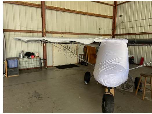
Rans S-12 Canopy/Nose & Wing Covers, test fit