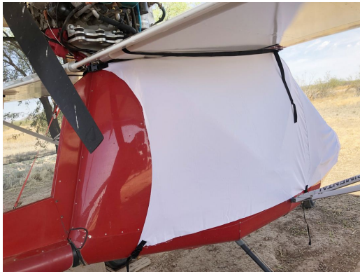
Rans S-12 Airaille Canopy/Nose Cover (test fit cover)