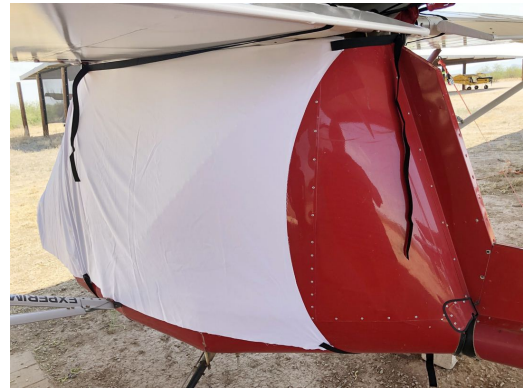
Rans S-12 Airaille Canopy/Nose Cover (test fit cover)