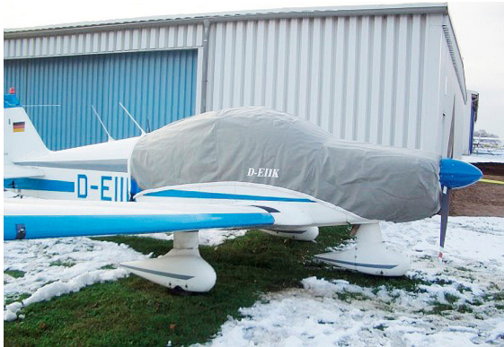
Robin R.2160 Canopy/Engine Cover