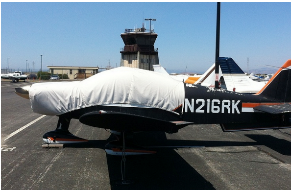
Robin Canopy/Engine Cover

This cover type is made from Silver Acrylic Sunbrella canvas and is 100% lined with a soft and smooth microfiber. Bruce's Custom Covers developed this material combination especially for aircraft protection. The outer material is medium weight and treated for water resistance, UV resistance and anti-static buildup. The inner lining is a very soft and smooth microfiber to prevent scratching. The material is very reflective, and tests show that the cabin interior temperature can be reduced to near-ambient temperature on the hottest of days. It is water, ice and snow repellent, yet breathable to allow moisture to escape from between the cover and the aircraft surface.