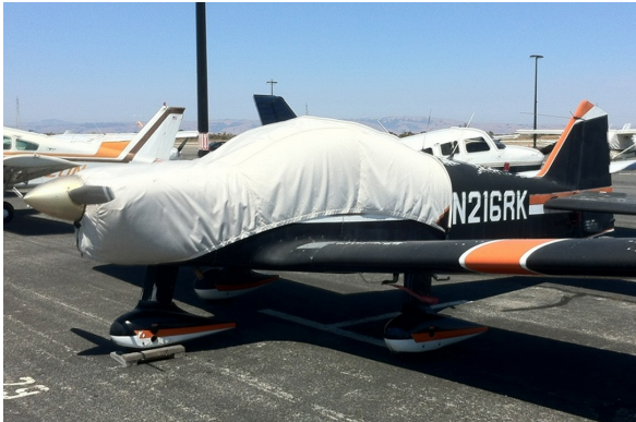
Robin Canopy/Engine Cover

Travel Covers are made with Silver Solution-Dyed Polyester fabric and only lined over the windshield to save weight. The material is lightweight and more compact for easy stowage in the aircraft. The polyester material is water resistant, but only intended for occasional use outside. We also have an ultra lightweight material available for fitted hangar dust covers. For daily outdoor use, the non-travel Sunbrella Cover is the best choice.