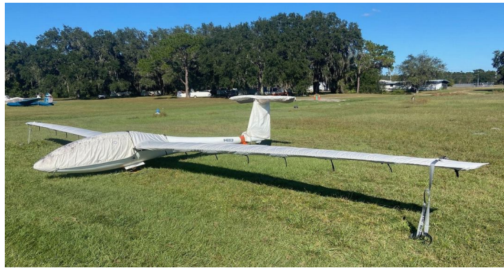
Rolladen-Schneider LS-4 Wing Covers

WINTER USE MATERIAL - Made with Solution-Dyed Polyester fabric, this option is intended for seasonal use to aid in deicing, rain mitigation, or for occasional travel. The material is lighter and more compact, but more susceptible to UV damage and may have a shorter useful life if used continuously outside than the all-year use material.