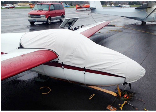
SGS Canopy/Nose Cover (1-26B model shown)