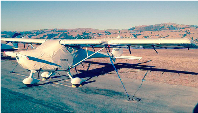
Remos Extended Canopy/Engine, Wing Covers