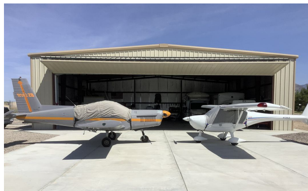
G-3/600 Travel Cover and Zlin 142 Canopy Cover