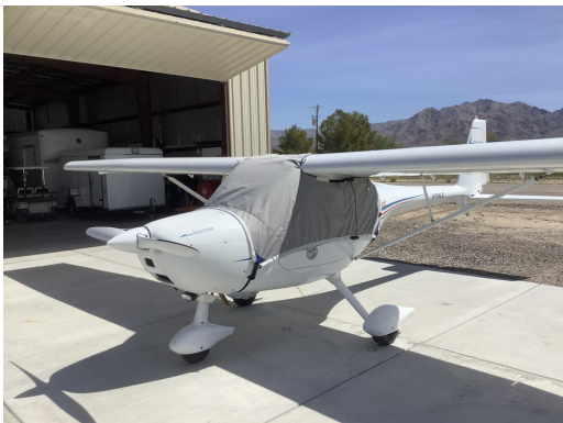
Remos G-3/600 Travel Cover

Travel Covers are made with Silver Solution-Dyed Polyester fabric and only lined over the windshield to save weight. The material is lightweight and more compact for easy stowage in the aircraft. The polyester material is water resistant, but only intended for occasional use outside. We also have an ultra lightweight material available for fitted hangar dust covers. For daily outdoor use, the non-travel Sunbrella Cover is the best choice.