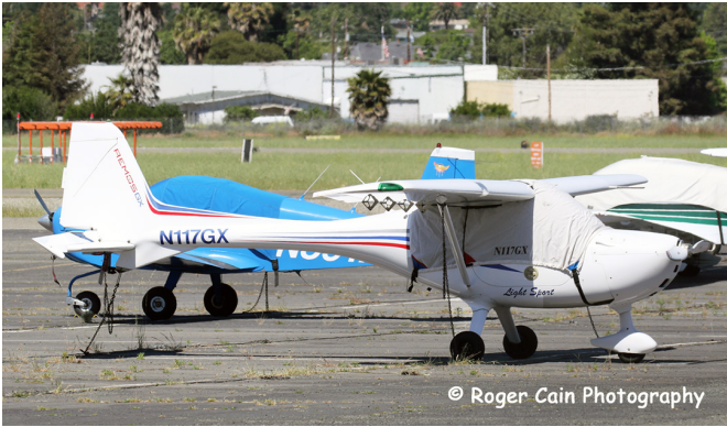
Remos GX Canopy Cover

This cover type is made from Silver Acrylic Sunbrella canvas and is 100% lined with a soft and smooth microfiber. Bruce's Custom Covers developed this material combination especially for aircraft protection. The outer material is medium weight and treated for water resistance, UV resistance and anti-static buildup. The inner lining is a very soft and smooth microfiber to prevent scratching. The material is very reflective, and tests show that the cabin interior temperature can be reduced to near-ambient temperature on the hottest of days. It is water, ice and snow repellent, yet breathable to allow moisture to escape from between the cover and the aircraft surface.