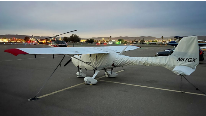
Remos RG-3 Complete Cover Set