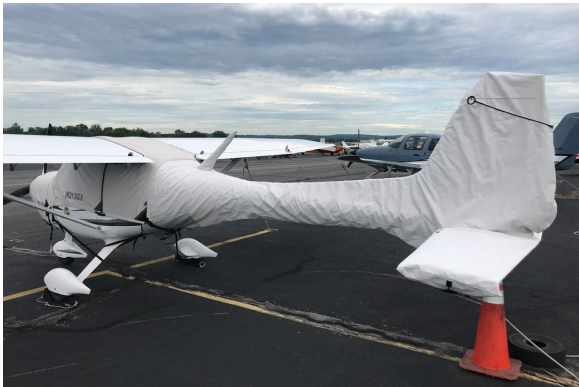
Remos G3 & GX MODELS Empennage Cover

WINTER USE MATERIAL - Made with Solution-Dyed Polyester fabric, this option is intended for seasonal use to aid in deicing, rain mitigation, or for occasional travel. The material is lighter and more compact, but more susceptible to UV damage and may have a shorter useful life if used continuously outside than the all-year use material.