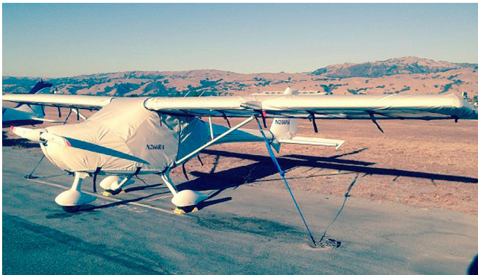
Remos Extended Canopy/Engine, Wing Covers

This cover type is made from Silver Acrylic Sunbrella canvas and is 100% lined with a soft and smooth microfiber. Bruce's Custom Covers developed this material combination especially for aircraft protection. The outer material is medium weight and treated for water resistance, UV resistance and anti-static buildup. The inner lining is a very soft and smooth microfiber to prevent scratching. The material is very reflective, and tests show that the cabin interior temperature can be reduced to near-ambient temperature on the hottest of days. It is water, ice and snow repellent, yet breathable to allow moisture to escape from between the cover and the aircraft surface.