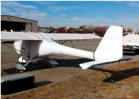
Remos Empennage Cover (test fit cover)