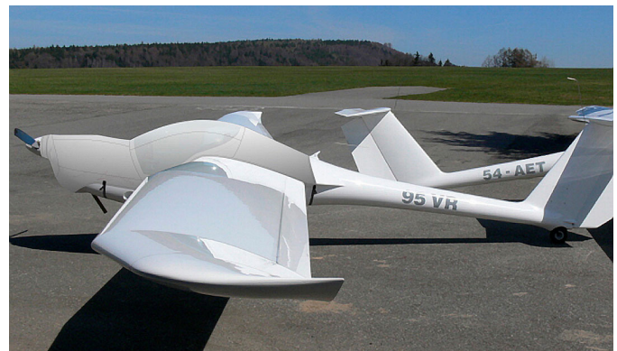
Lambda Canopy/Engine Cover (illustration)