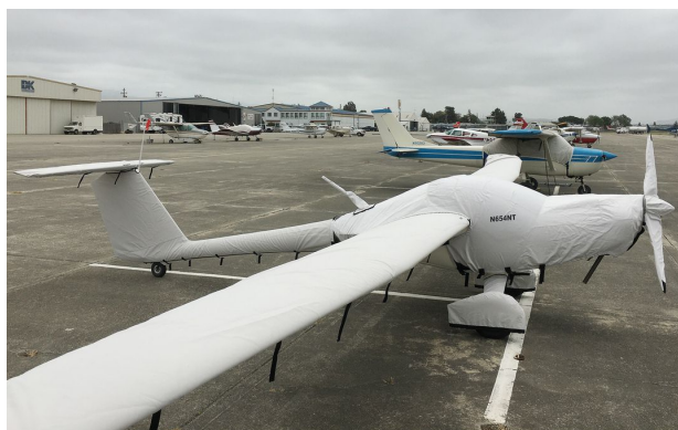
Distar Sundancer LSA Extended Canopy/Engine, Prop, Wheel pants, Wings & Empennage Covers