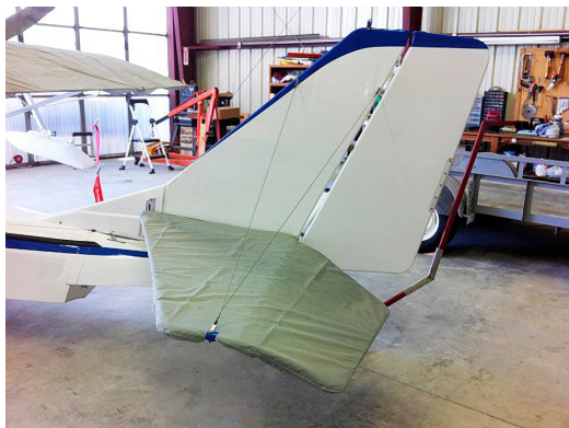
SeaRey Horizontal Stab. Cover (test fit cover)

WINTER USE MATERIAL - Made with Solution-Dyed Polyester fabric, this option is intended for seasonal use to aid in deicing, rain mitigation, or for occasional travel. The material is lighter and more compact, but more susceptible to UV damage and may have a shorter useful life if used continuously outside than the all-year use material.