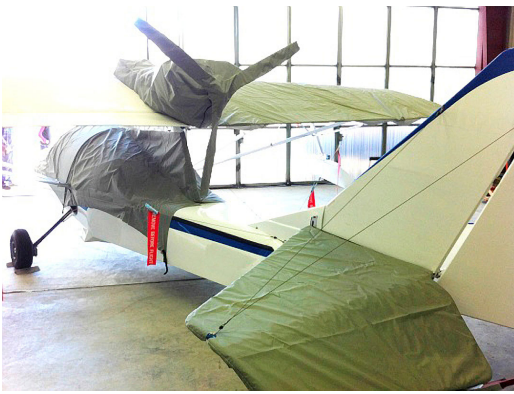
SeaRey Canopy, Engine, Wing & Horizontal Stab. (test fit covers)