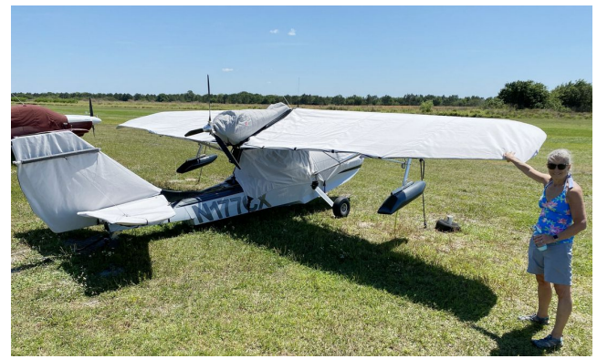
Searey Complete Cover Set