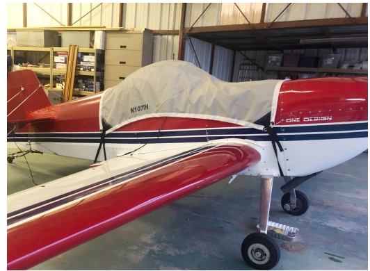
IAC One Design Travel Weight Canopy Cover