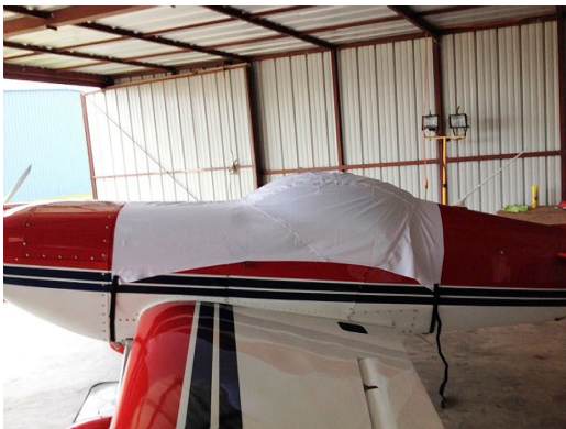
IAC One Design Canopy Cover, test fit cover

This cover type is made from Silver Acrylic Sunbrella canvas and is 100% lined with a soft and smooth microfiber. Bruce's Custom Covers developed this material combination especially for aircraft protection. The outer material is medium weight and treated for water resistance, UV resistance and anti-static buildup. The inner lining is a very soft and smooth microfiber to prevent scratching. The material is very reflective, and tests show that the cabin interior temperature can be reduced to near-ambient temperature on the hottest of days. It is water, ice and snow repellent, yet breathable to allow moisture to escape from between the cover and the aircraft surface.