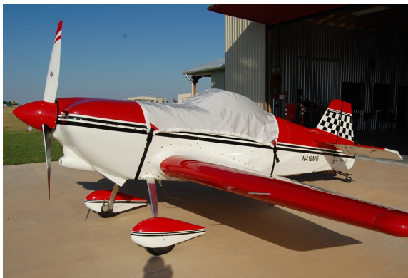
IAC One Design Canopy Cover