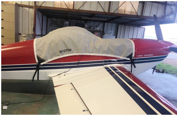
IAC One Design Travel Weight Canopy Cover

Travel Covers are made with Silver Solution-Dyed Polyester fabric and only lined over the windshield to save weight. The material is lightweight and more compact for easy stowage in the aircraft. The polyester material is water resistant, but only intended for occasional use outside. We also have an ultra lightweight material available for fitted hangar dust covers. For daily outdoor use, the non-travel Sunbrella Cover is the best choice.