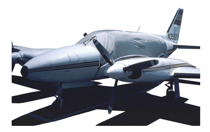
Piper Navajo Canopy Cover

This cover type is made from Silver Acrylic Sunbrella canvas and is 100% lined with a soft and smooth microfiber. Bruce's Custom Covers developed this material combination especially for aircraft protection. The outer material is medium weight and treated for water resistance, UV resistance and anti-static buildup. The inner lining is a very soft and smooth microfiber to prevent scratching. The material is very reflective, and tests show that the cabin interior temperature can be reduced to near-ambient temperature on the hottest of days. It is water, ice and snow repellent, yet breathable to allow moisture to escape from between the cover and the aircraft surface.