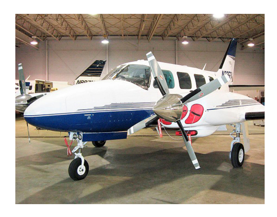
Piper Navajo PA31 Engine Inlet Plugs (Panther Conversion)