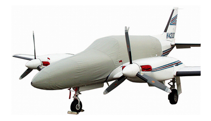
Piper Navajo CR Canopy/Nose Cover