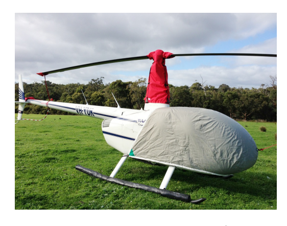
Robinson R-44 Bubble, Rotor Hub, Tail Rotor Covers, & Blade Tie-Downs