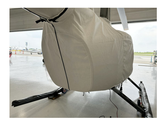
Robinson R-66 Engine Cover

WINTER USE MATERIAL - Made with Solution-Dyed Polyester fabric, this option is intended for seasonal use to aid in deicing, rain mitigation, or for occasional travel. The material is lighter and more compact, but more susceptible to UV damage and may have a shorter useful life if used continuously outside than the all-year use material.