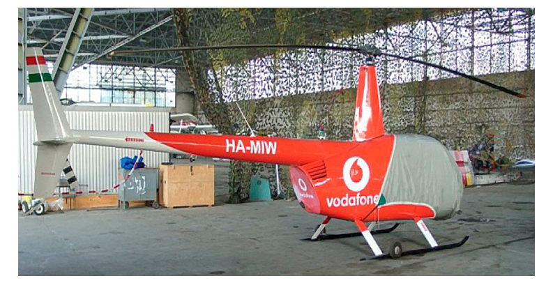
Robinson R-44 Bubble Covers