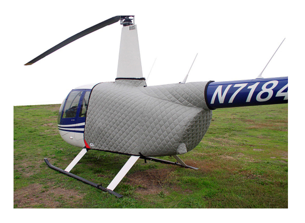
Robinson R-44 Insulated Engine Cover