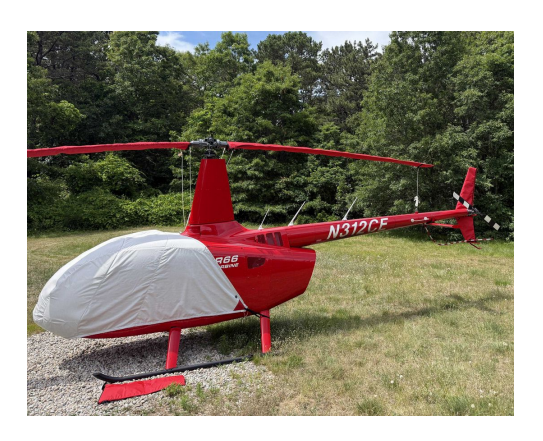
Robinson R66 Bubble, Blades, Stabilizer Covers