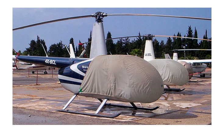
Robinson R-44 Bubble Covers