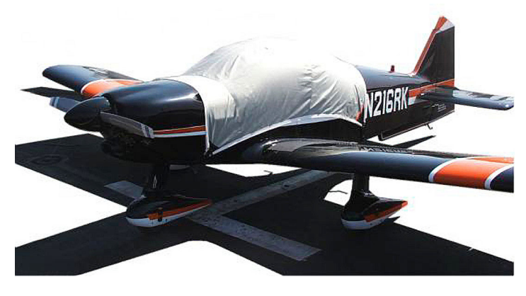
Robin R.2160 Canopy Cover

Travel Covers are made with Silver Solution-Dyed Polyester fabric and only lined over the windshield to save weight. The material is lightweight and more compact for easy stowage in the aircraft. The polyester material is water resistant, but only intended for occasional use outside. We also have an ultra lightweight material available for fitted hangar dust covers. For daily outdoor use, the non-travel Sunbrella Cover is the best choice.