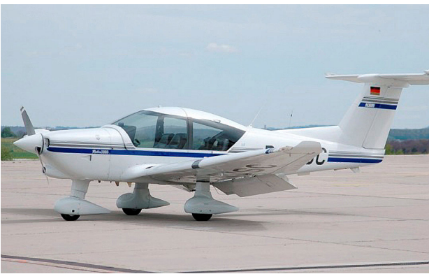
Canopy Cover for the Robin 3140 & R-3000