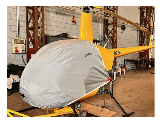
Robinson R-22 Travel Cover, Light Weight Travel Bubble Cover