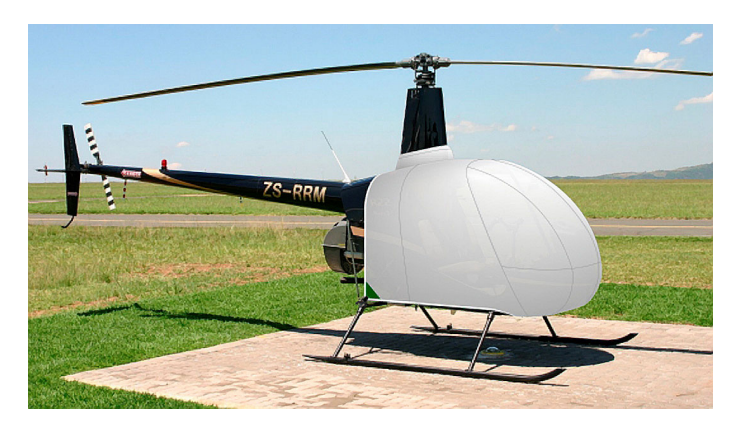
Robinson R-22 Extended Canopy Cover (illustration)