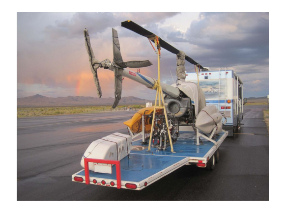
Robinson R-22 Bubble Cover (Ext. Past Rotor Hub), Engine Cover, Tailboom Cover, Blade Covers, Rotor Hub Cover, & Tail Rotor Gear Box Cover