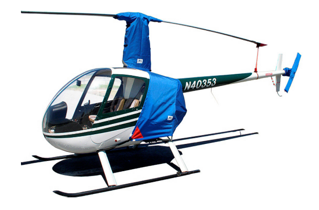
Robinson R-22 Engine, Rotor Mast & Tail Rotor Covers, with Blade Tie-down