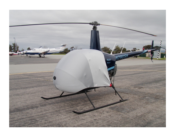
Robinson R-22 Light Weight Travel Cover