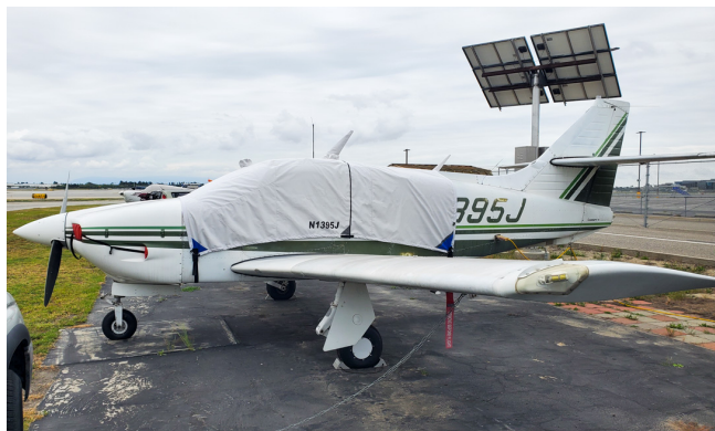
Rockwell International 112A Canopy Cover

This cover type is made from Silver Acrylic Sunbrella canvas and is 100% lined with a soft and smooth microfiber. Bruce's Custom Covers developed this material combination especially for aircraft protection. The outer material is medium weight and treated for water resistance, UV resistance and anti-static buildup. The inner lining is a very soft and smooth microfiber to prevent scratching. The material is very reflective, and tests show that the cabin interior temperature can be reduced to near-ambient temperature on the hottest of days. It is water, ice and snow repellent, yet breathable to allow moisture to escape from between the cover and the aircraft surface.