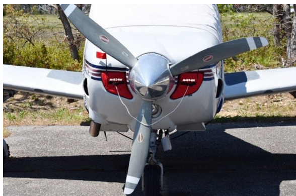
Rockwell 114 Engine Plugs