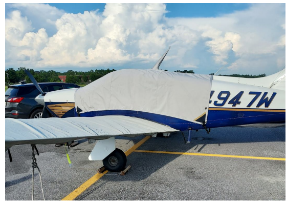
Rockwell 114 Canopy Cover & Wing Covers