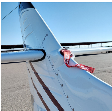
Rockwell Aero Commander 114 Dorsal Inlet Plug

Engine Inlet Plugs are custom fit for your Rockwell Aero Commander 112, 114 intakes, made with heavy-duty vinyl material, and stuffed with a single block of sculpted urethane foam. Each plug has a zipper that allows the foam to be removed and dried if necessary. Engine plugs have warning flags that are visible from the cockpit or 'remove before flight' streamers sewn onto the face of the plugs. Most plugs are imprinted with the aircraft registration number in black for an extra charge. Storage bag NOT included. Engine plugs may be inserted after flight when the engine is still warm. Engine Inlet Plugs are commonly referred to as Cowl Plugs, Intake Plugs, Cowl Blocks, Engine Blocks, and Engine Bungs.