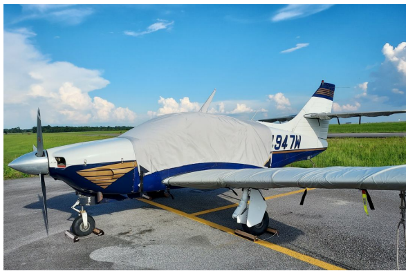
Rockwell 114 Canopy Cover & Wing Covers