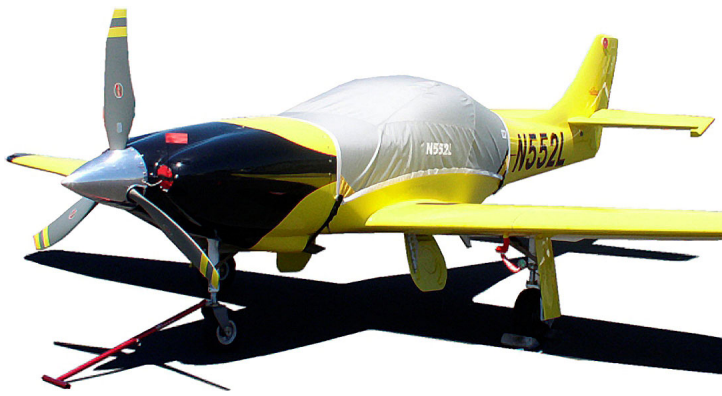
Canopy Cover for Lancair Legacy