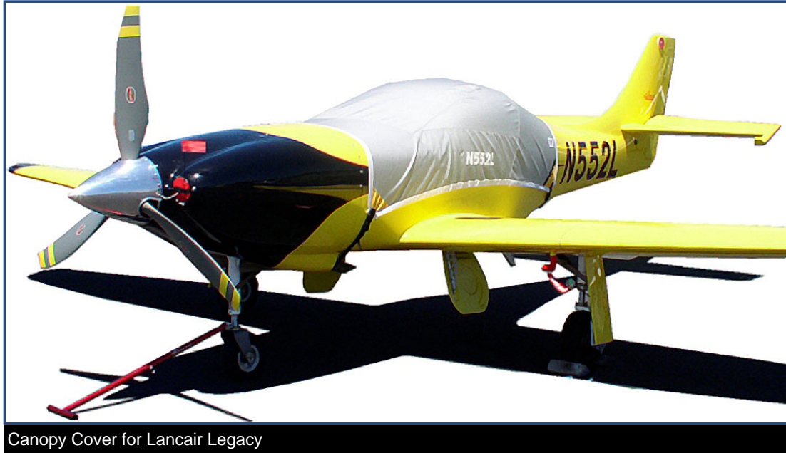
Canopy Cover for Lancair Legacy