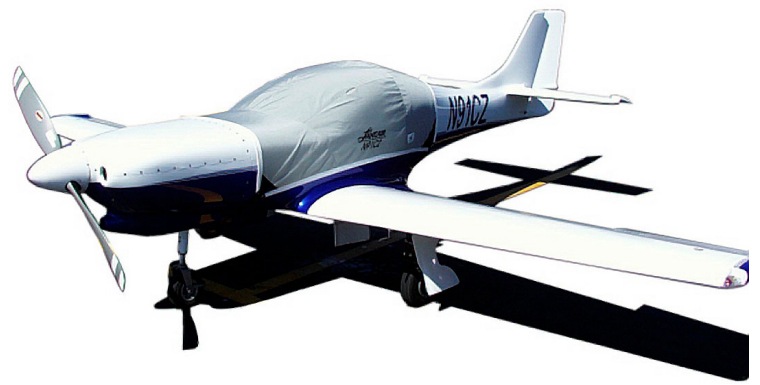
Canopy Cover for Lancair 320/360