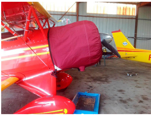
Waco Engine Cover