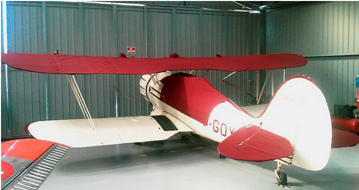
Waco UPF-7 Upper Wing Cover, Horizontal Stabilizer Cover & Canopy Cover

WINTER USE MATERIAL - Made with Solution-Dyed Polyester fabric, this option is intended for seasonal use to aid in deicing, rain mitigation, or for occasional travel. The material is lighter and more compact, but more susceptible to UV damage and may have a shorter useful life if used continuously outside than the all-year use material.