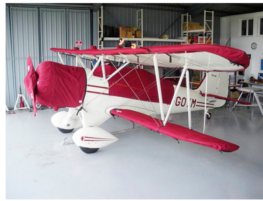
Waco UPF-7 Canopy, Wings, Stab's, Engine, Prop Covers