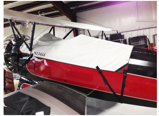
Waco QCF/UBF Canopy Cover