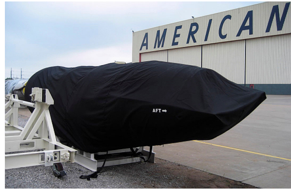
PW 2000 Series OFF-LINK ENGINE STORAGE COVER, Rain Cap