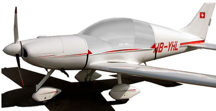
Pulsar Canopy Cover (illustration)

This cover type is made from Silver Acrylic Sunbrella canvas and is 100% lined with a soft and smooth microfiber. Bruce's Custom Covers developed this material combination especially for aircraft protection. The outer material is medium weight and treated for water resistance, UV resistance and anti-static buildup. The inner lining is a very soft and smooth microfiber to prevent scratching. The material is very reflective, and tests show that the cabin interior temperature can be reduced to near-ambient temperature on the hottest of days. It is water, ice and snow repellent, yet breathable to allow moisture to escape from between the cover and the aircraft surface.