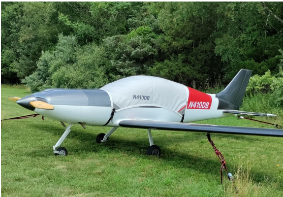
Pulsar Canopy Cover