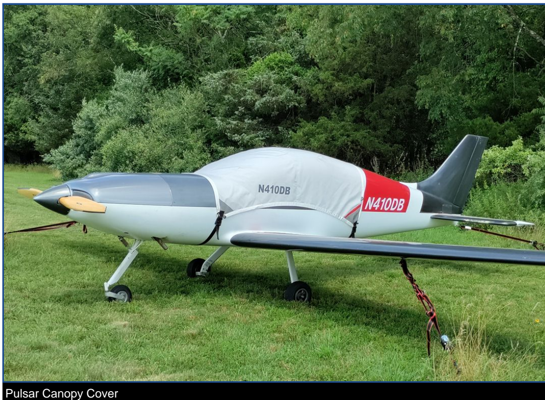
Pulsar Canopy Cover