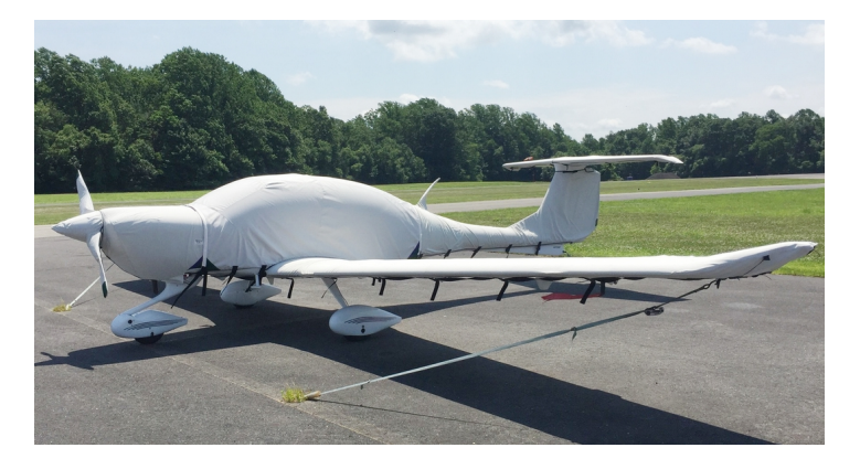
Diamond DA-40 Extended Canopy, Wing, Engine, Prop, Empennage & Horiz. Stab Covers

WINTER USE MATERIAL - Made with Solution-Dyed Polyester fabric, this option is intended for seasonal use to aid in deicing, rain mitigation, or for occasional travel. The material is lighter and more compact, but more susceptible to UV damage and may have a shorter useful life if used continuously outside than the all-year use material.