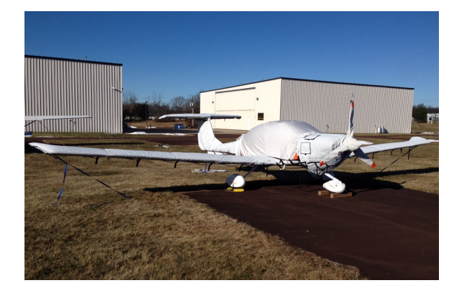
Diamond DA-40 Full Cover Set, with Insulated Engine Cover