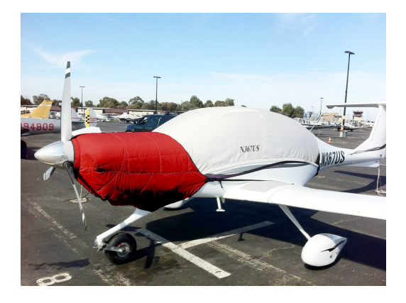
Diamond DA-40 Insulated Engine Cover, Red

This cover type is made from Silver Acrylic Sunbrella canvas and is 100% lined with a soft and smooth microfiber. Bruce's Custom Covers developed this material combination especially for aircraft protection. The outer material is medium weight and treated for water resistance, UV resistance and anti-static buildup. The inner lining is a very soft and smooth microfiber to prevent scratching. The material is very reflective, and tests show that the cabin interior temperature can be reduced to near-ambient temperature on the hottest of days. It is water, ice and snow repellent, yet breathable to allow moisture to escape from between the cover and the aircraft surface.