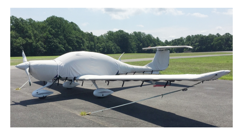
Diamond DA-40 Extended Canopy, Wing, Engine, Prop, Empennage & Horiz. Stab Covers