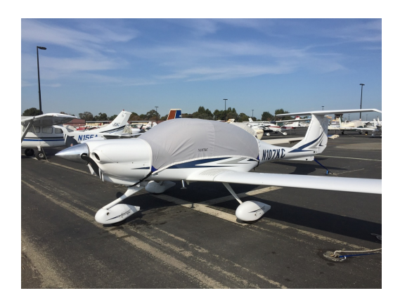
Diamond DA-40 Travel Cover, Light Weight Travel Canopy Cover