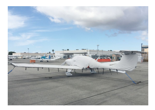
Diamond DA-40 Full Cover Set

This cover type is made from Silver Acrylic Sunbrella canvas and is 100% lined with a soft and smooth microfiber. Bruce's Custom Covers developed this material combination especially for aircraft protection. The outer material is medium weight and treated for water resistance, UV resistance and anti-static buildup. The inner lining is a very soft and smooth microfiber to prevent scratching. The material is very reflective, and tests show that the cabin interior temperature can be reduced to near-ambient temperature on the hottest of days. It is water, ice and snow repellent, yet breathable to allow moisture to escape from between the cover and the aircraft surface.