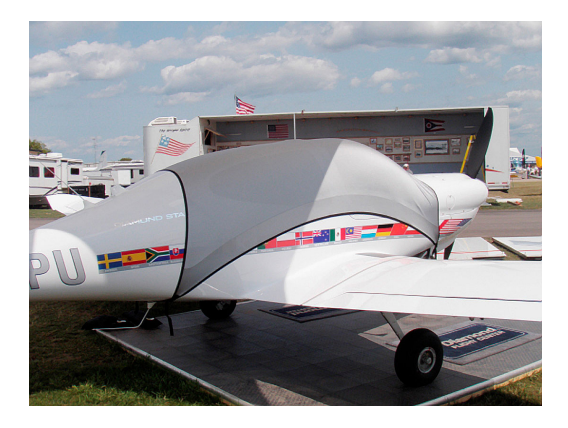
Diamond DA-40 Light Weight Travel Cover (Spandex Flyaway Type)

Travel Covers are made with Silver Solution-Dyed Polyester fabric and only lined over the windshield to save weight. The material is lightweight and more compact for easy stowage in the aircraft. The polyester material is water resistant, but only intended for occasional use outside. We also have an ultra lightweight material available for fitted hangar dust covers. For daily outdoor use, the non-travel Sunbrella Cover is the best choice.