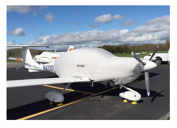
Diamond DA-40 Extended Canopy/Engine Cover